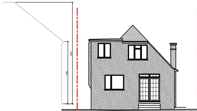
2 EXISTING REAR ELEVATION