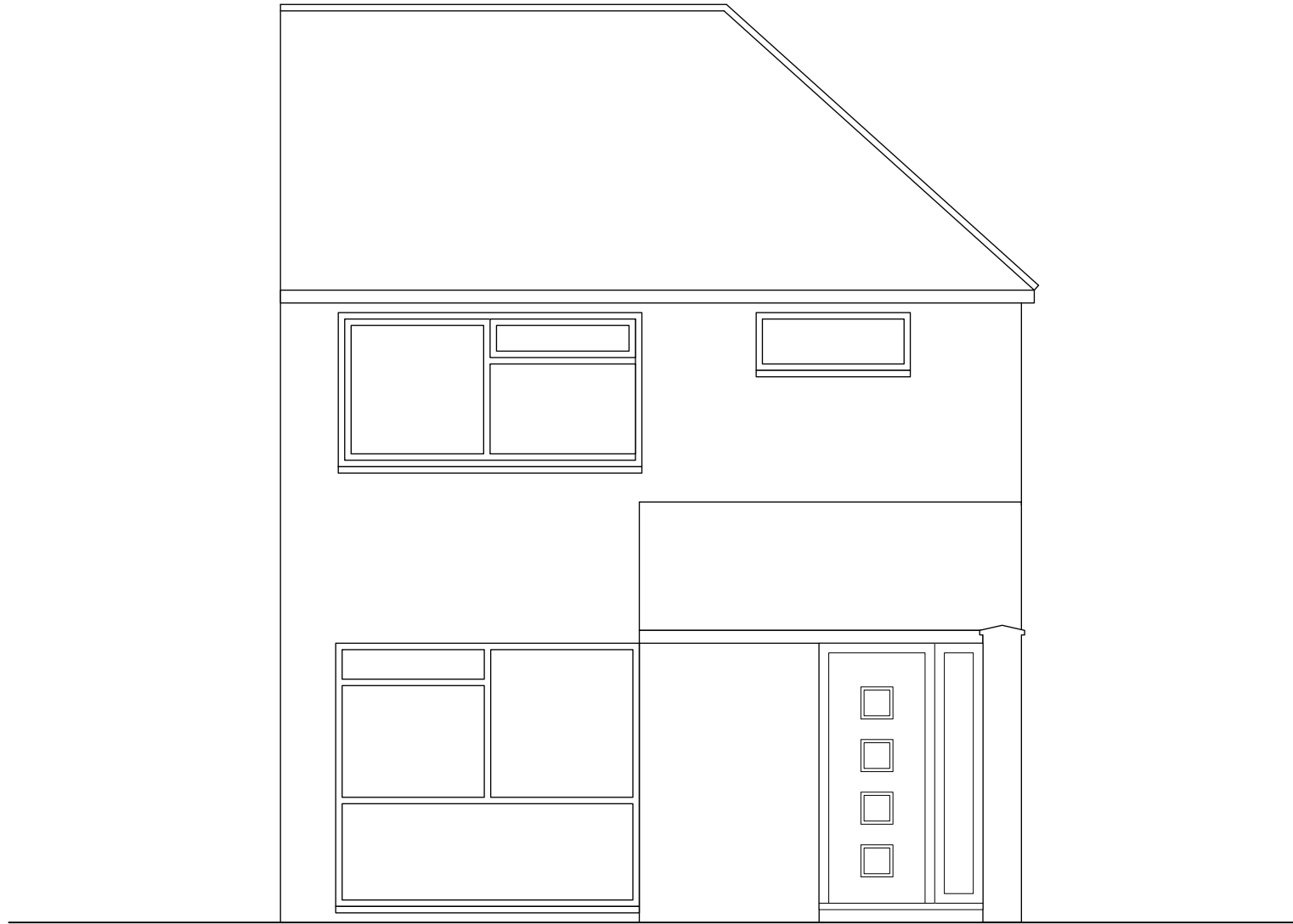
1 Front Elevation