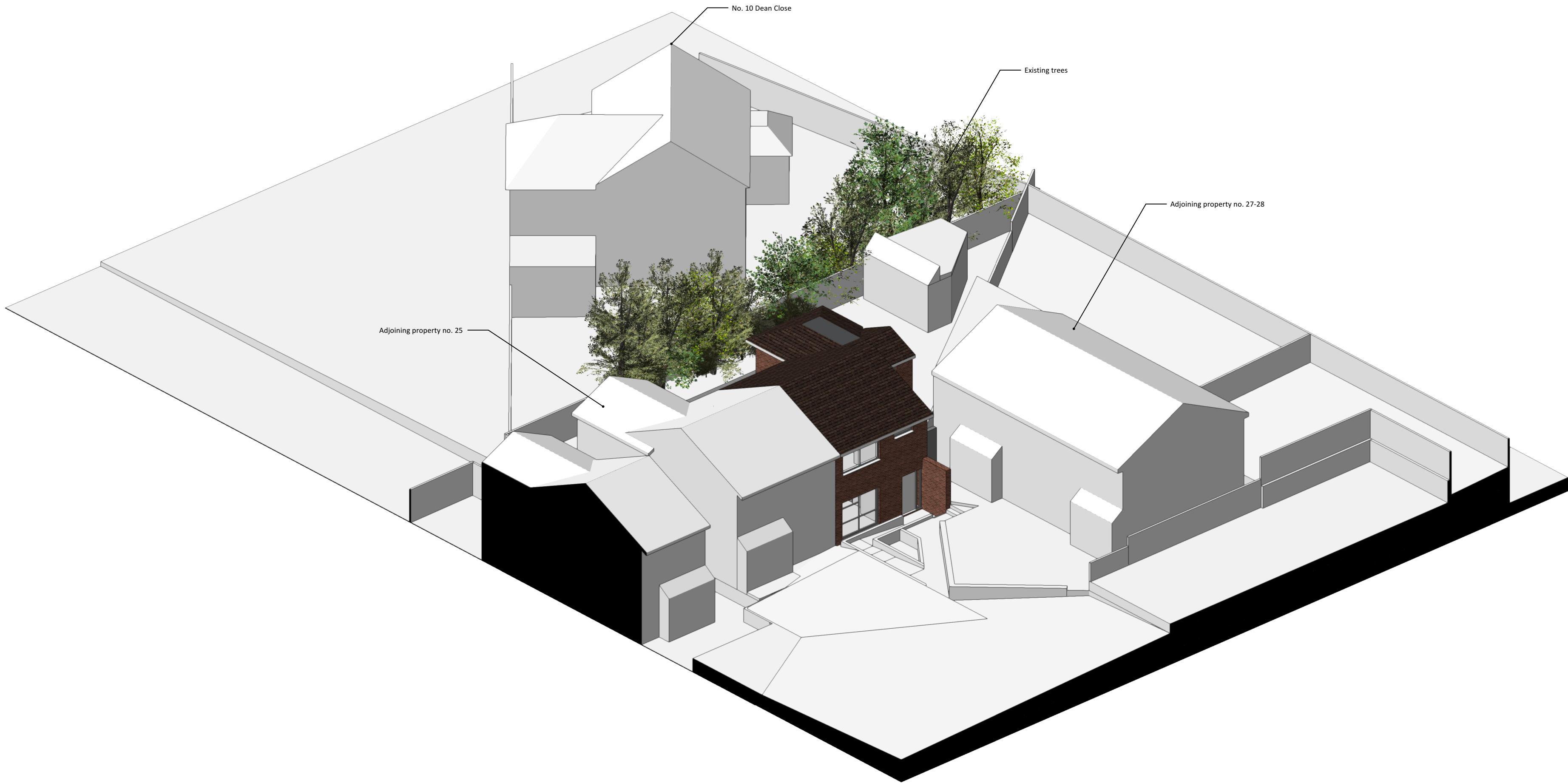
3 Axo looking North-East