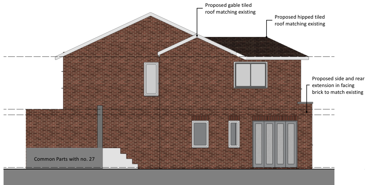
3 South-East (Left) Scale: 1:100