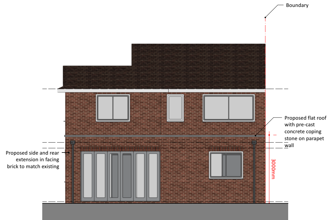
2 North-East (Rear) Scale: 1:100