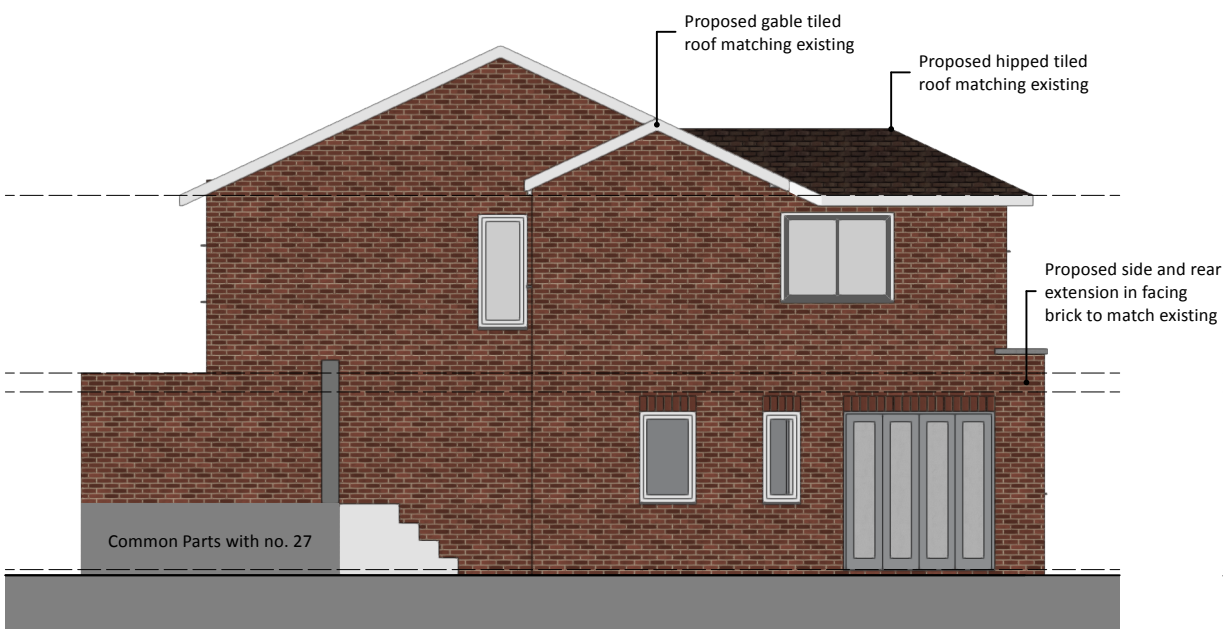
3 South-East (Left) Scale: 1:100