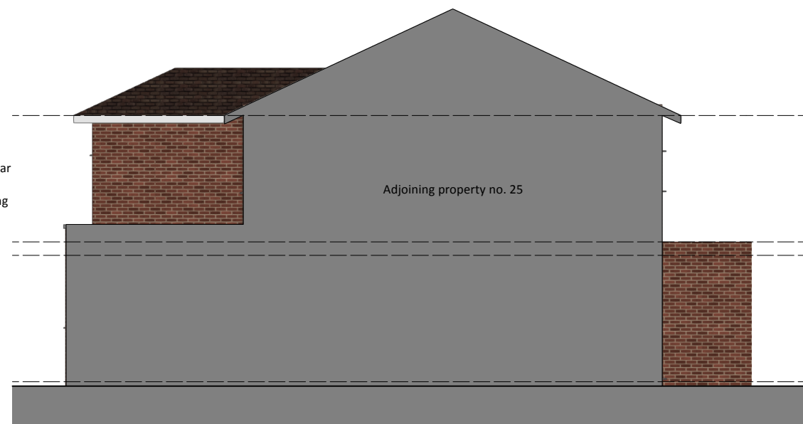
4 North-West Scale: 1:100