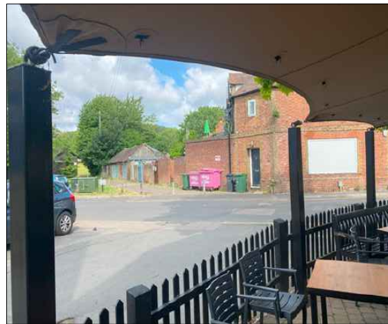
POST & TENT JUNCTION