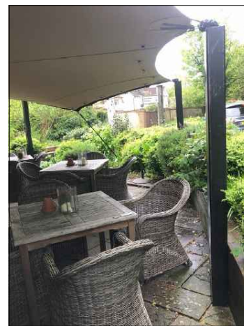
POST & TENT JUNCTION