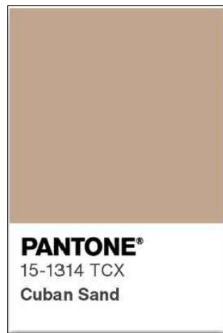
TENT FABRIC COLOUR