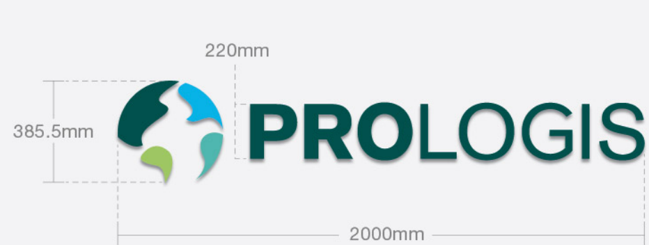
Scale 1:20 @A3