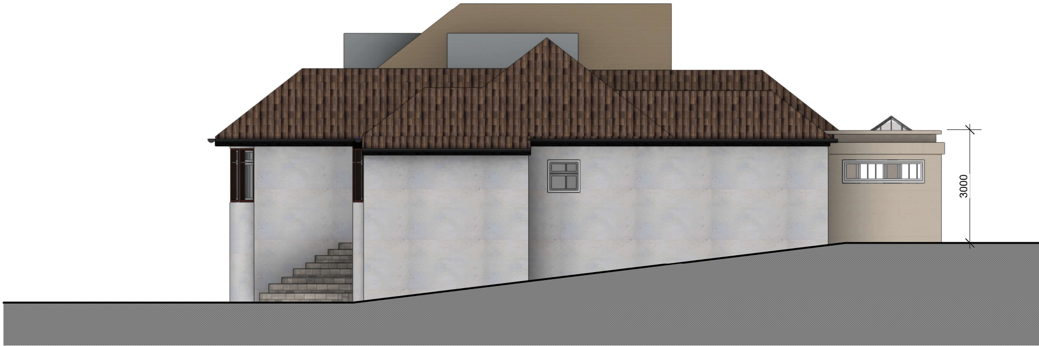
1 01 PROP ELEV SIDE Scale: 1:100