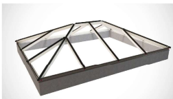
ROOF LANTERN over flat roof KORNICHE or similar slim line aluminium roof lantern

To be double glazed + to meet 'U' value of min. 2.0 W/m sq.K. All roof lights to be A-A fire rated. Fully thermally broken construction. Double up rafters on the side of opening, supporting double trimmers above & below opening. Bolt together with M12 bolts at 450 c/s. Must be 450mm minimum clear opening with non opening fasteners. Fixed in accordance with the manufacturers instructions.