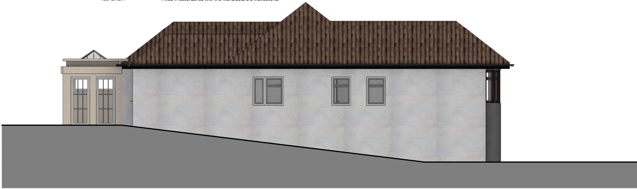
2 02 PROP ELEV SIDE Scale: 1:100

To be double glazed + to meet 'U' value of min. 2.0 W/m sq.K. All roof lights to be A-A fire rated. Fully thermally broken construction. Double up rafters on the side of opening, supporting double trimmers above & below opening. Bolt together with M12 bolts at 450 c/s. Must be 450mm minimum clear opening with non opening fasteners. Fixed in accordance with the manufacturers instructions.