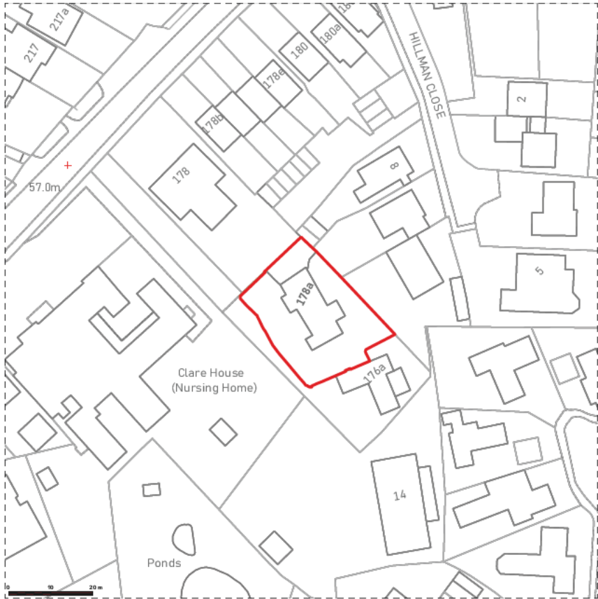
2 Location Plan Scale: 1:1250