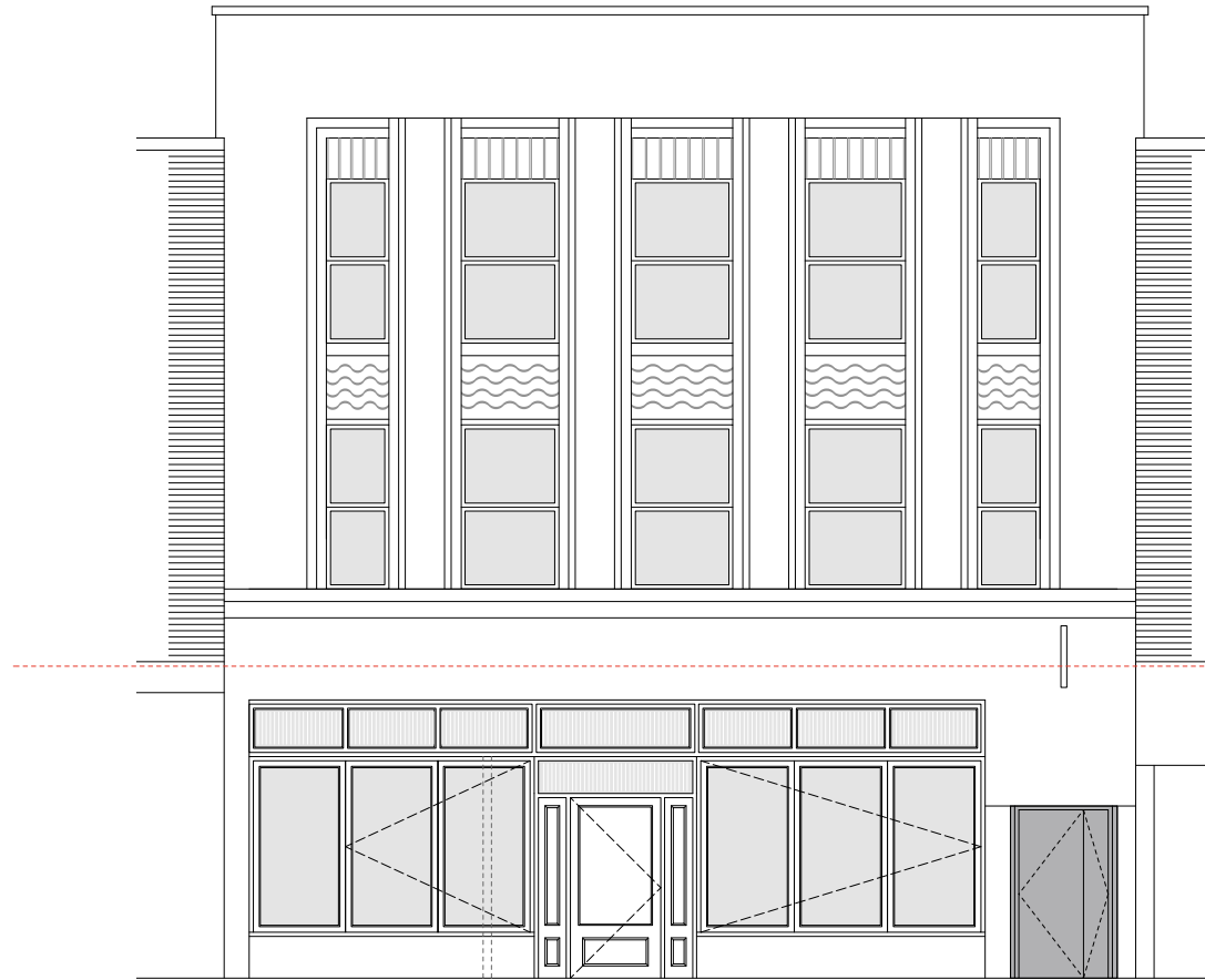
HIGH STREET - SOUTHWEST ELEVATION - 1:50@A1, 1:100@A3