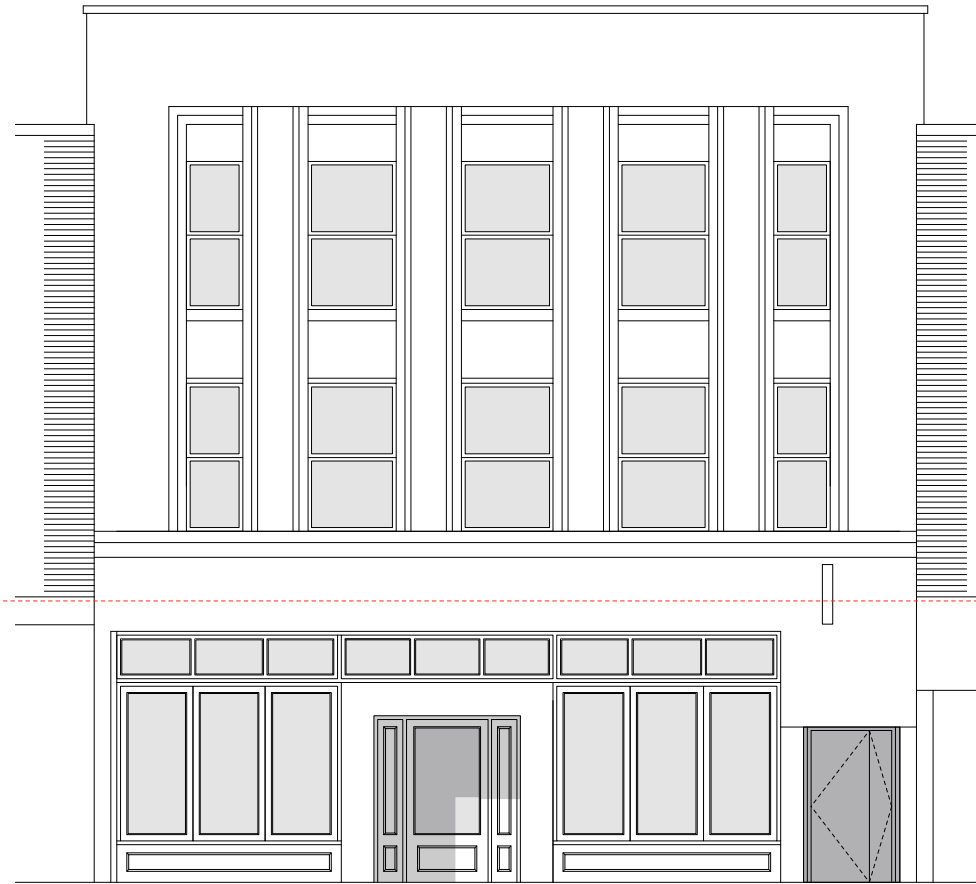
HIGH STREET - SOUTHWEST ELEVATION - 1:50@A1, 1:100@A3