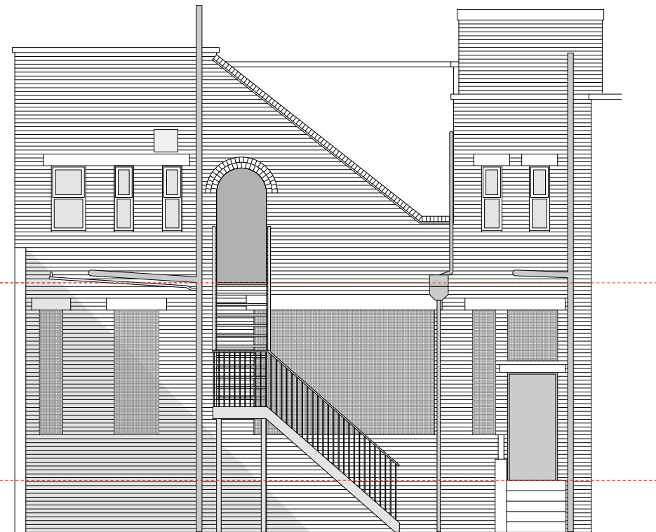
REAR - NORTHEAST ELEVATION - 1:50@A1, 1:100@A3