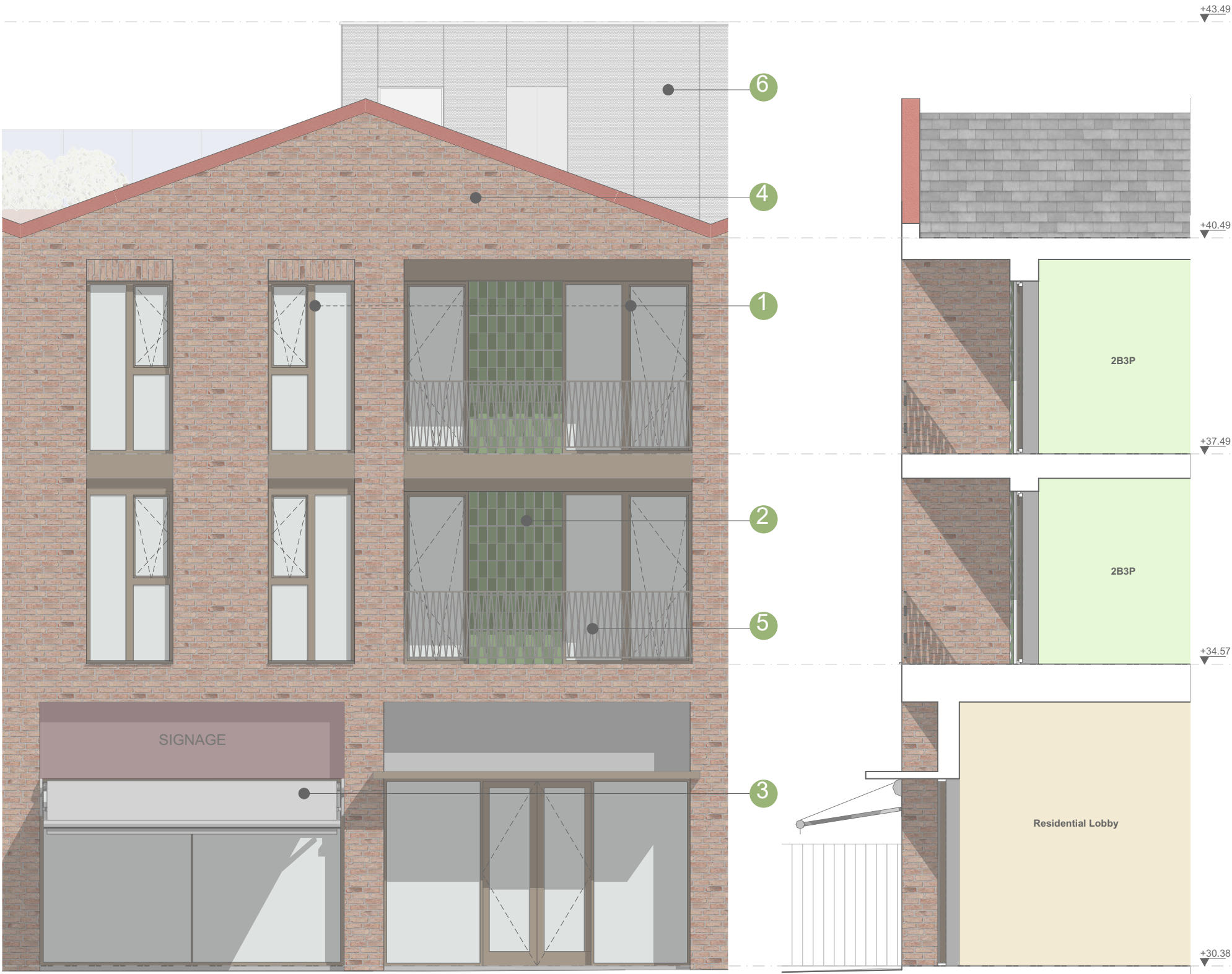
Bay elevation Yeading Lane