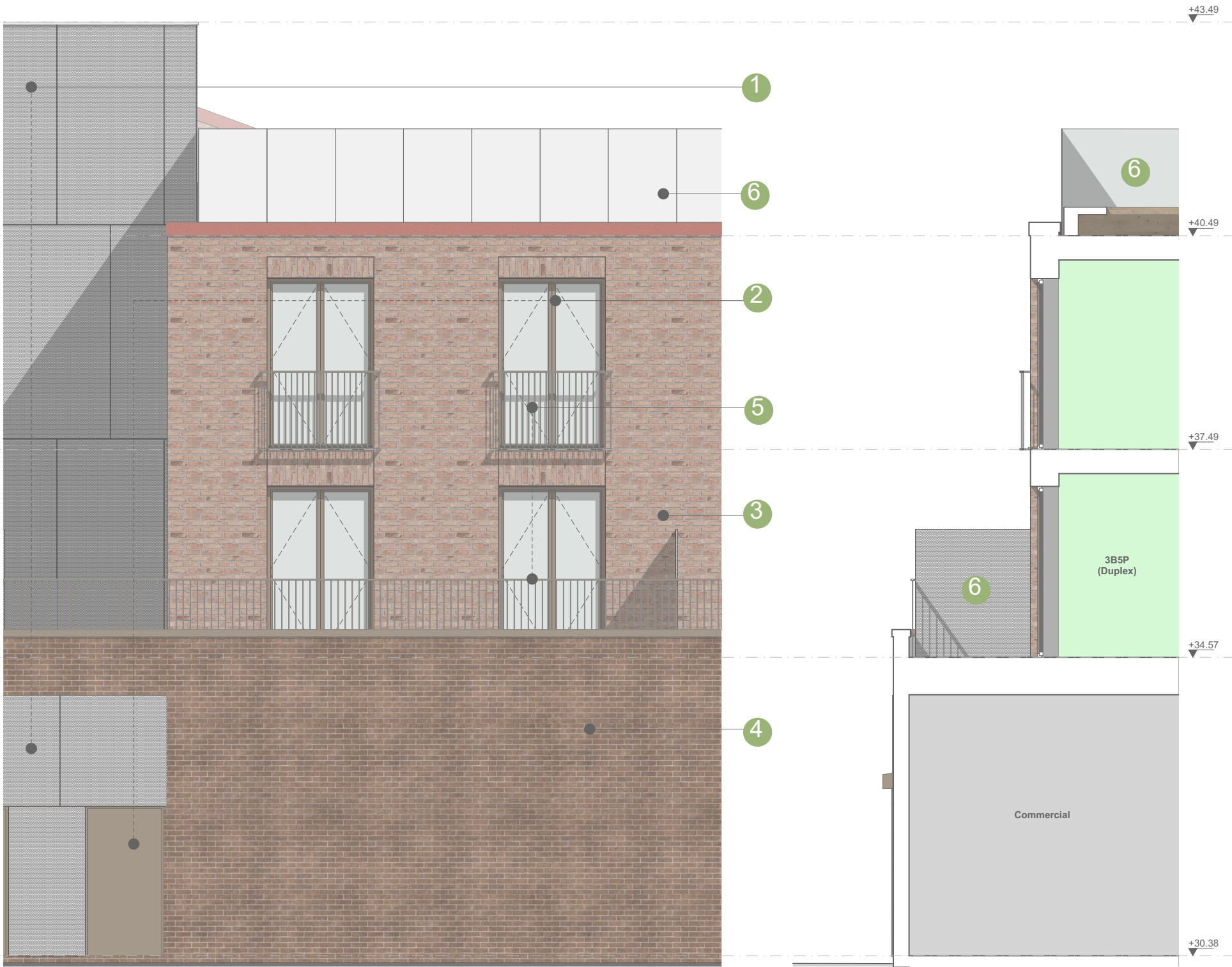
Bay elevation to the Yard