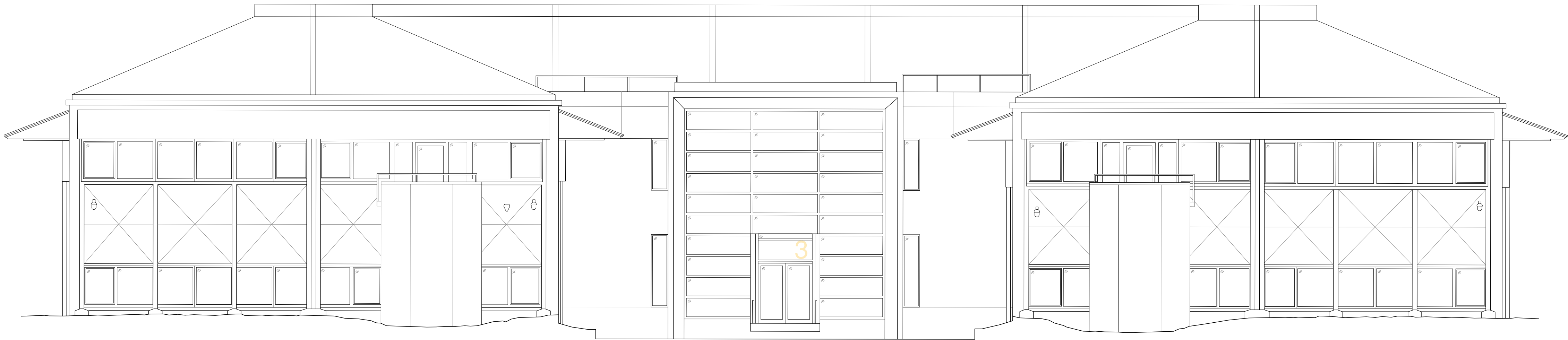
EXISTING EAST ELEVATION 01 1:100