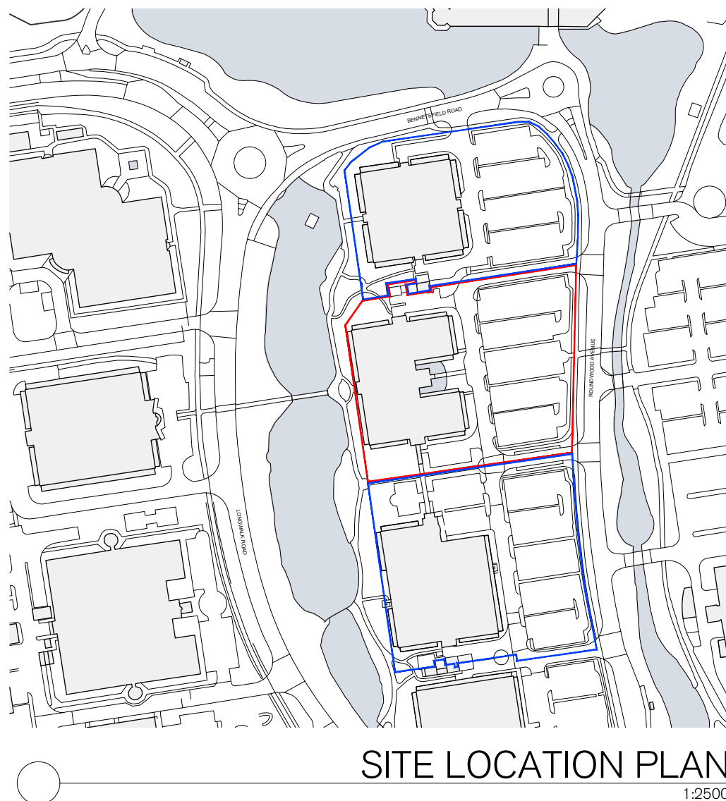
SITE LOCATION PLAN 1:2500