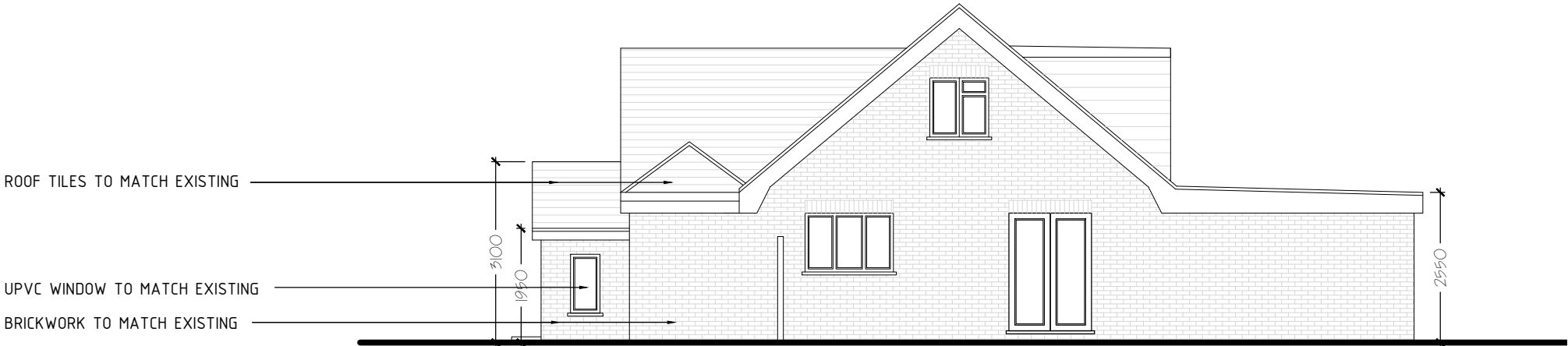
Proposed RHS Elevation Scale 1:100