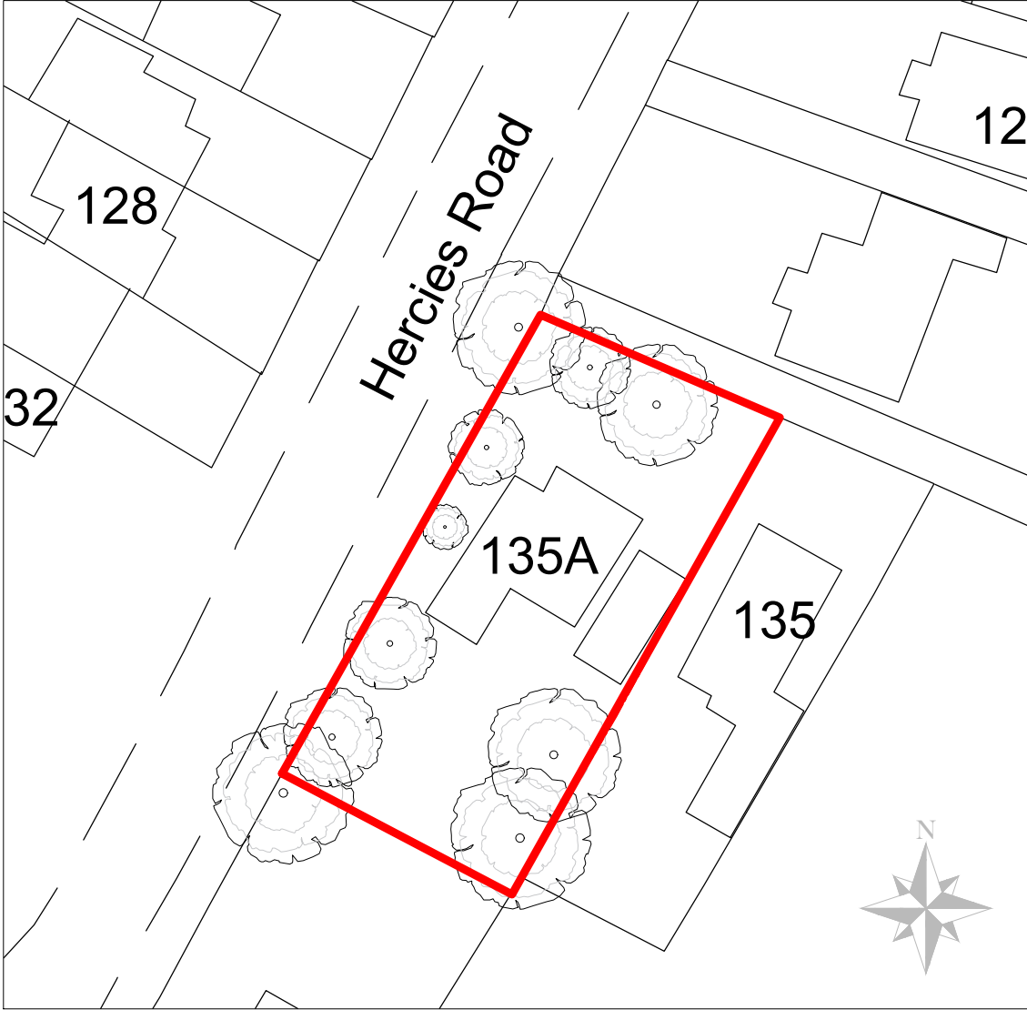
Existing Block Plan Scale 1:500