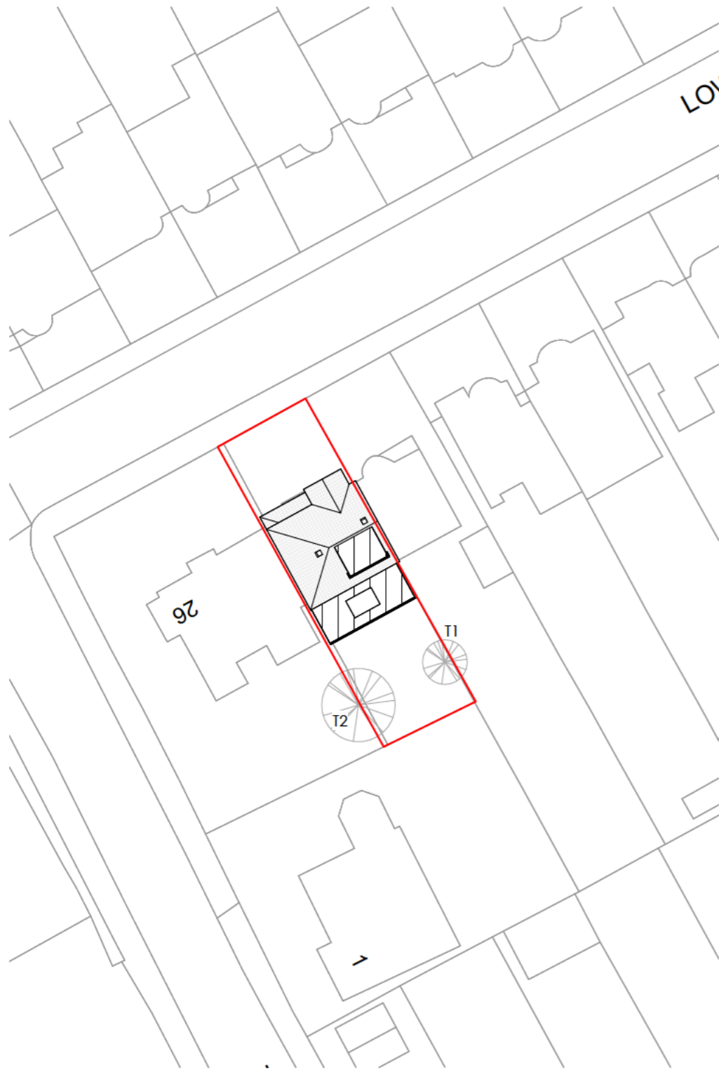
Proposed Site Plan 1 : 500