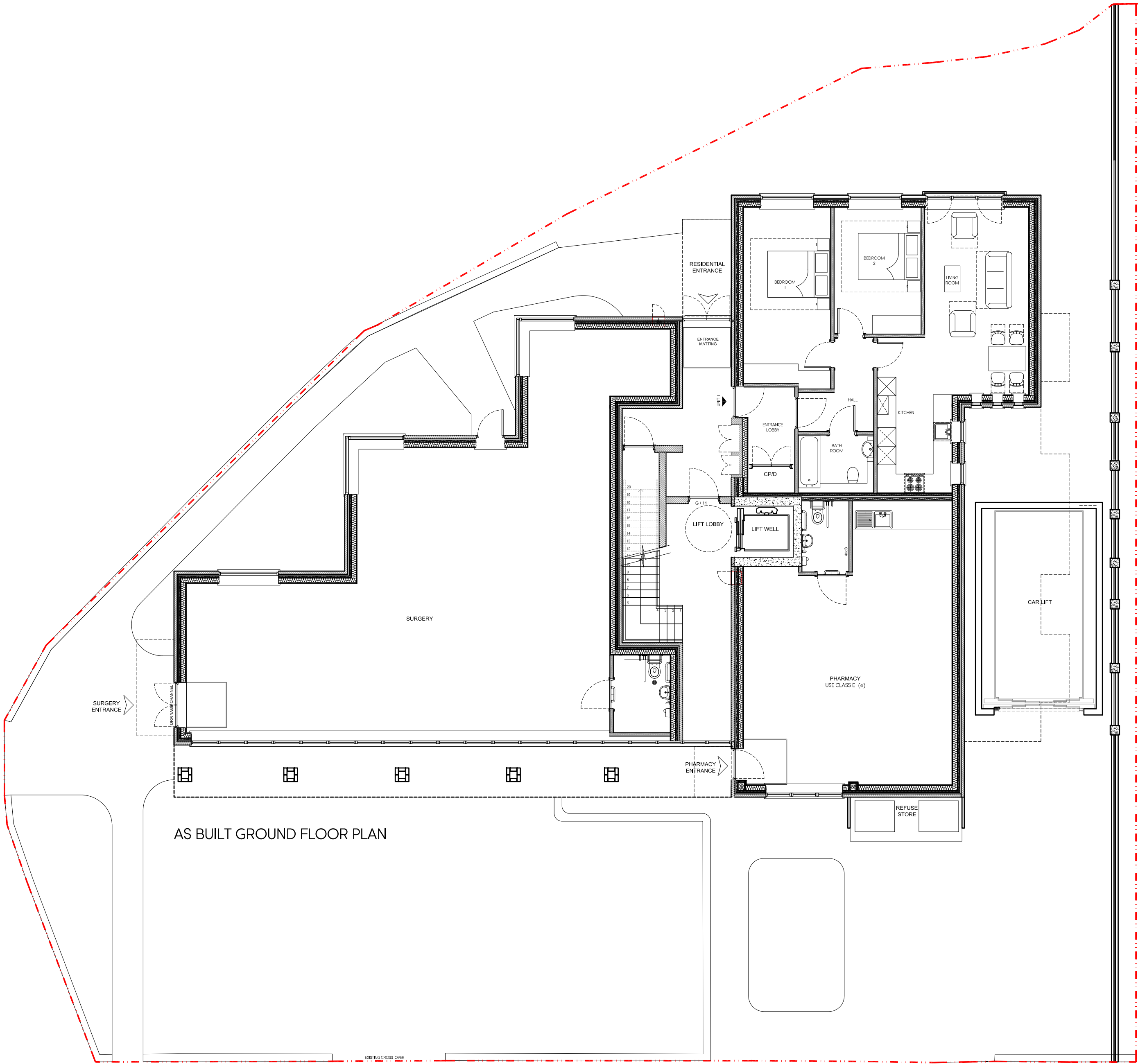
AS BUILT GROUND FLOOR PLAN