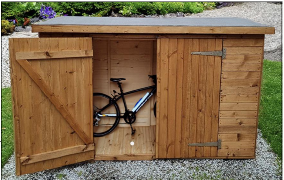
Timber Bike Shed (2100mm x 1200mm)