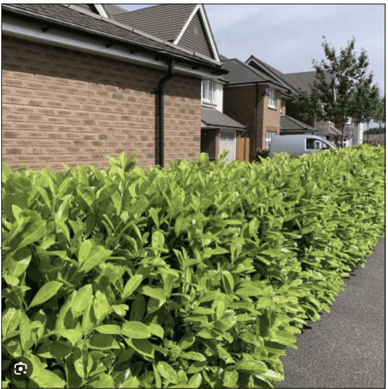
Cherry Laurel Hedge