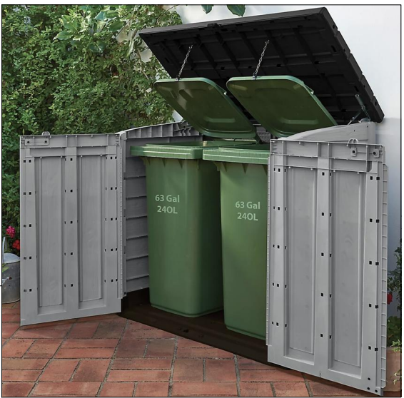
Ketter Store It Out Max grey wood effect plastic 1200L Refuse Storage from B&Q