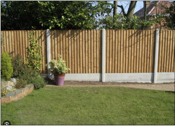
1.8m close-boarded timber fencing with gravel board and concrete posts.