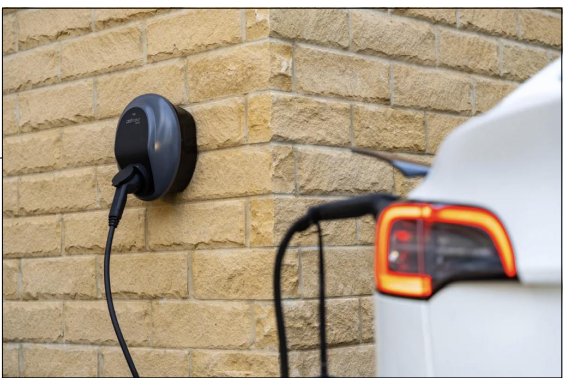
EVC charger from Pod Point Electric Vehicle Charger Tethered Solo 3 7kW wall mounted