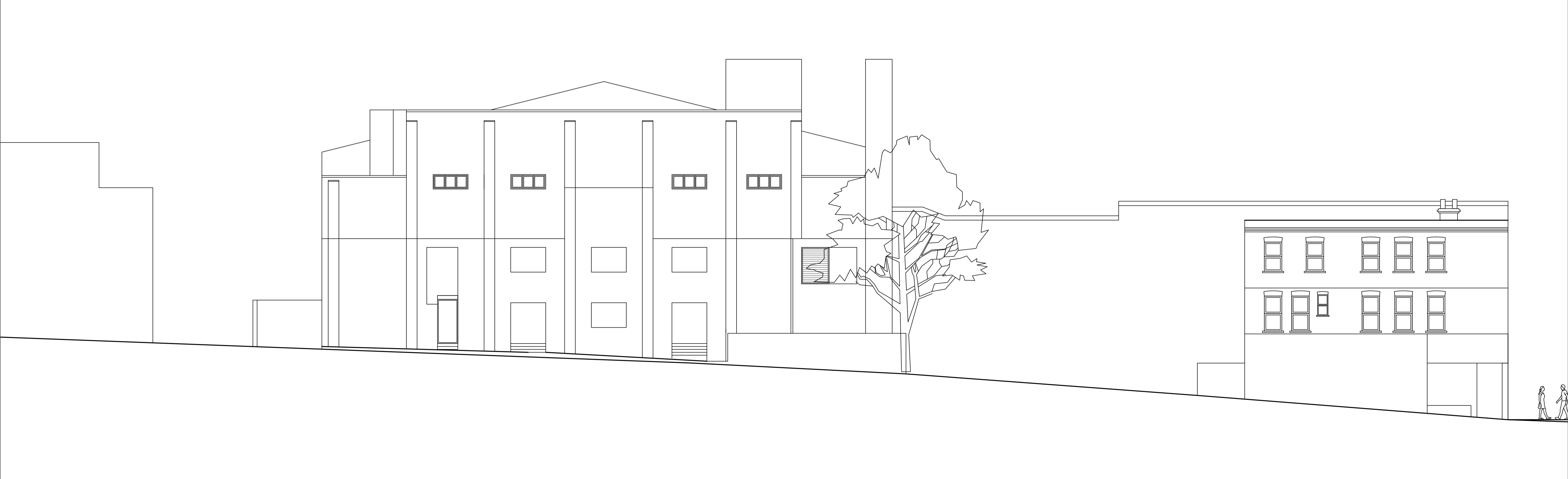
West elevation 1:100 at A1