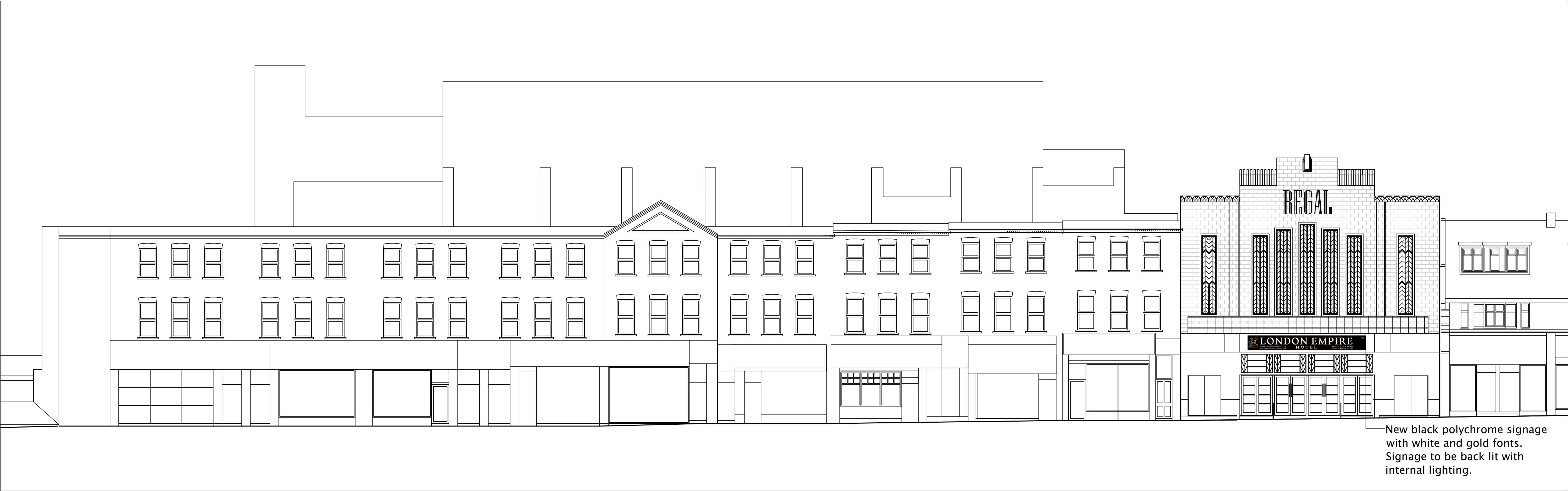
Street elevation 1:100 at A1