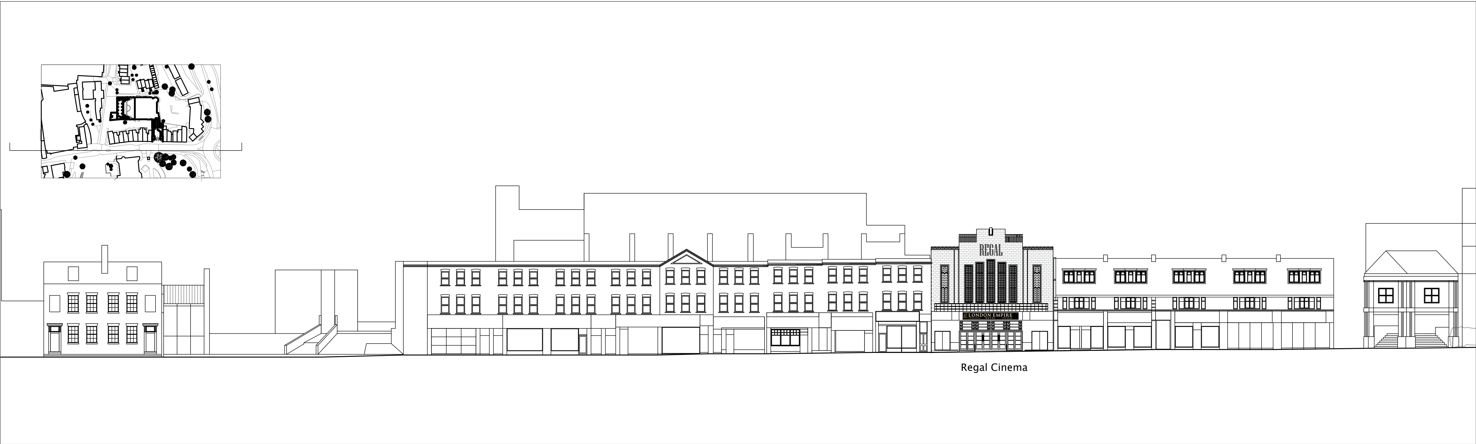
Street elevation 1:200 at A1