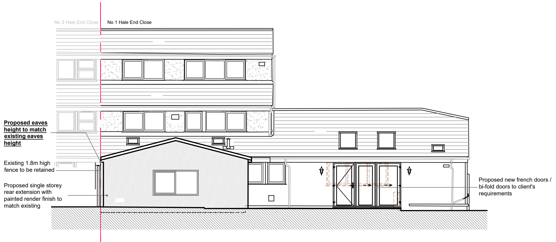
Elevation Facing West as Proposed Scale 1:100 @A3

IMPORTANT NOTE: FINAL LAYOUT SUBJECT TO STRUCTURAL WORKS CONFIRMATION