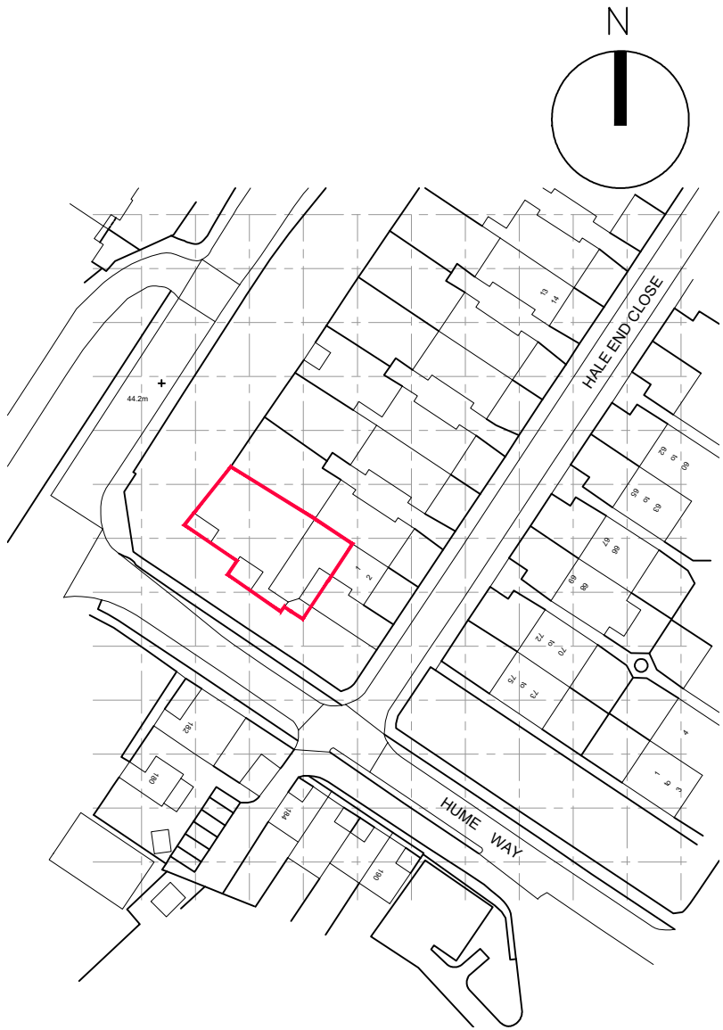
Site Location Plan Scale 1:1250 @ A3