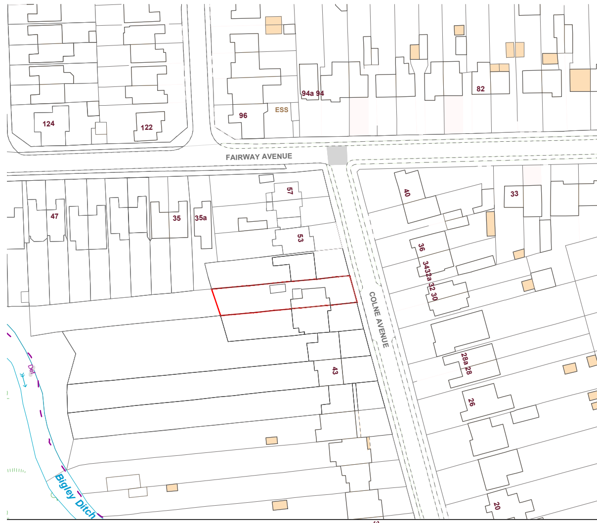
01 - OS MAP SCALE 1:1250