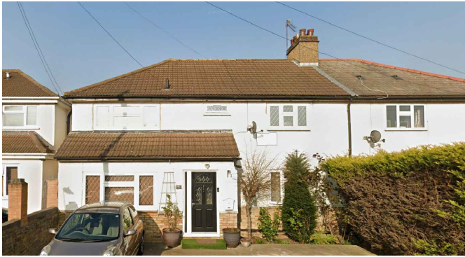
01 - FRONT IMAGE