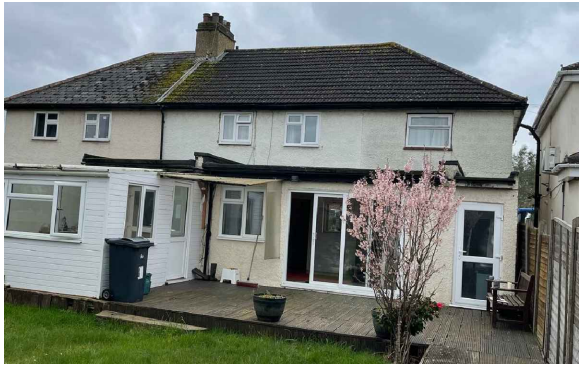
02 - REAR IMAGE