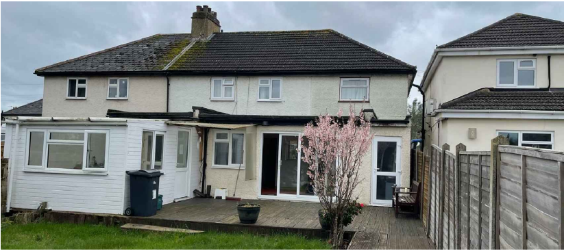
03 - REAR IMAGE