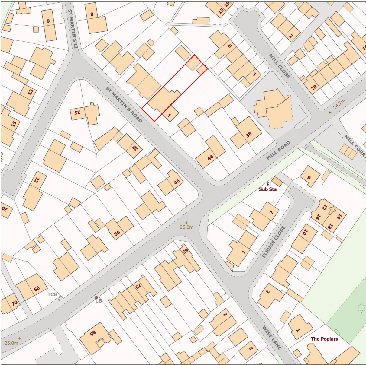
04 - OS MAP SCALE 1:1250