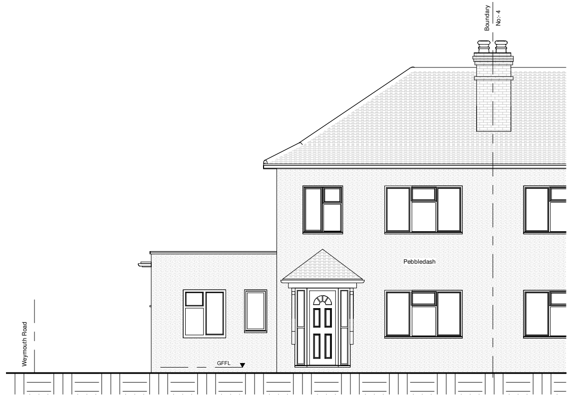
1 Existing South 1 : 100