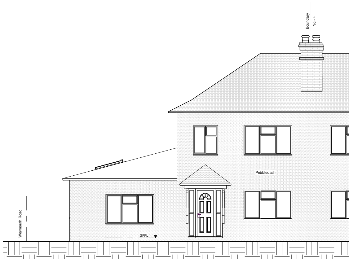
3 Proposed South 1 : 100