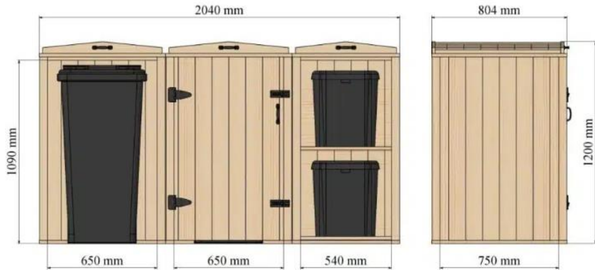
Bellus Double Wheelie Bin and 2 Recycling Box Storage Unit