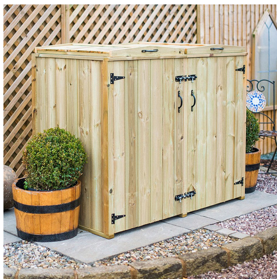
Bin Store Example