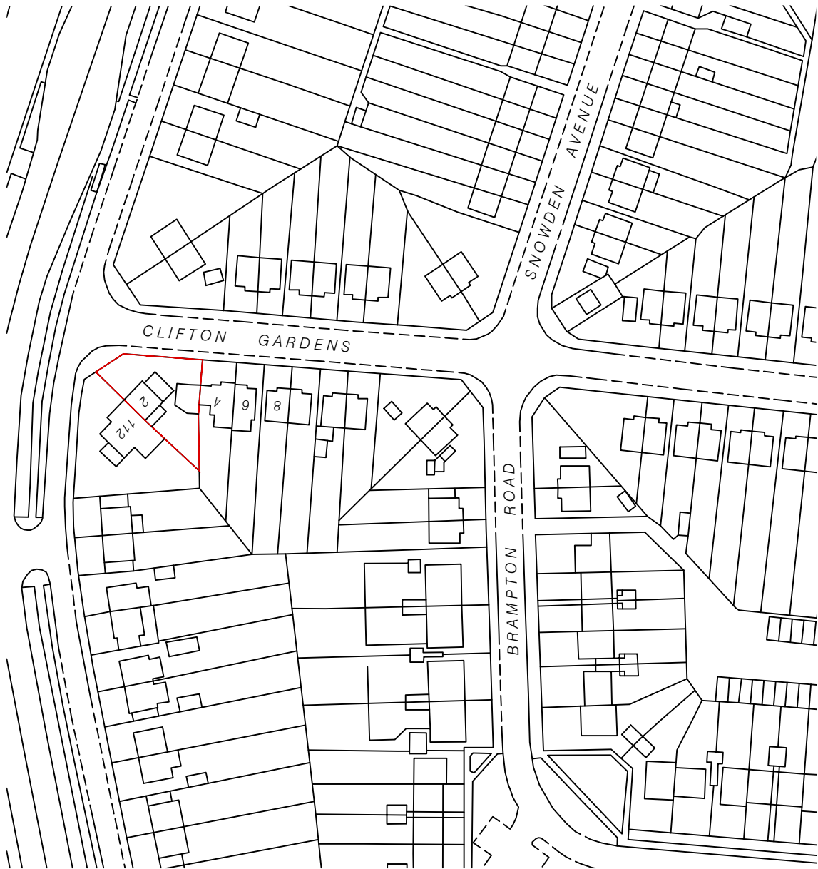
EXISTING LOCATION PLAN