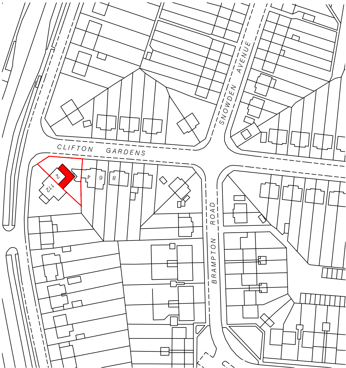
PROPOSED LOCATION PLAN