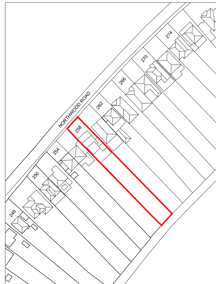
SITE PLAN Scale: 1/1250