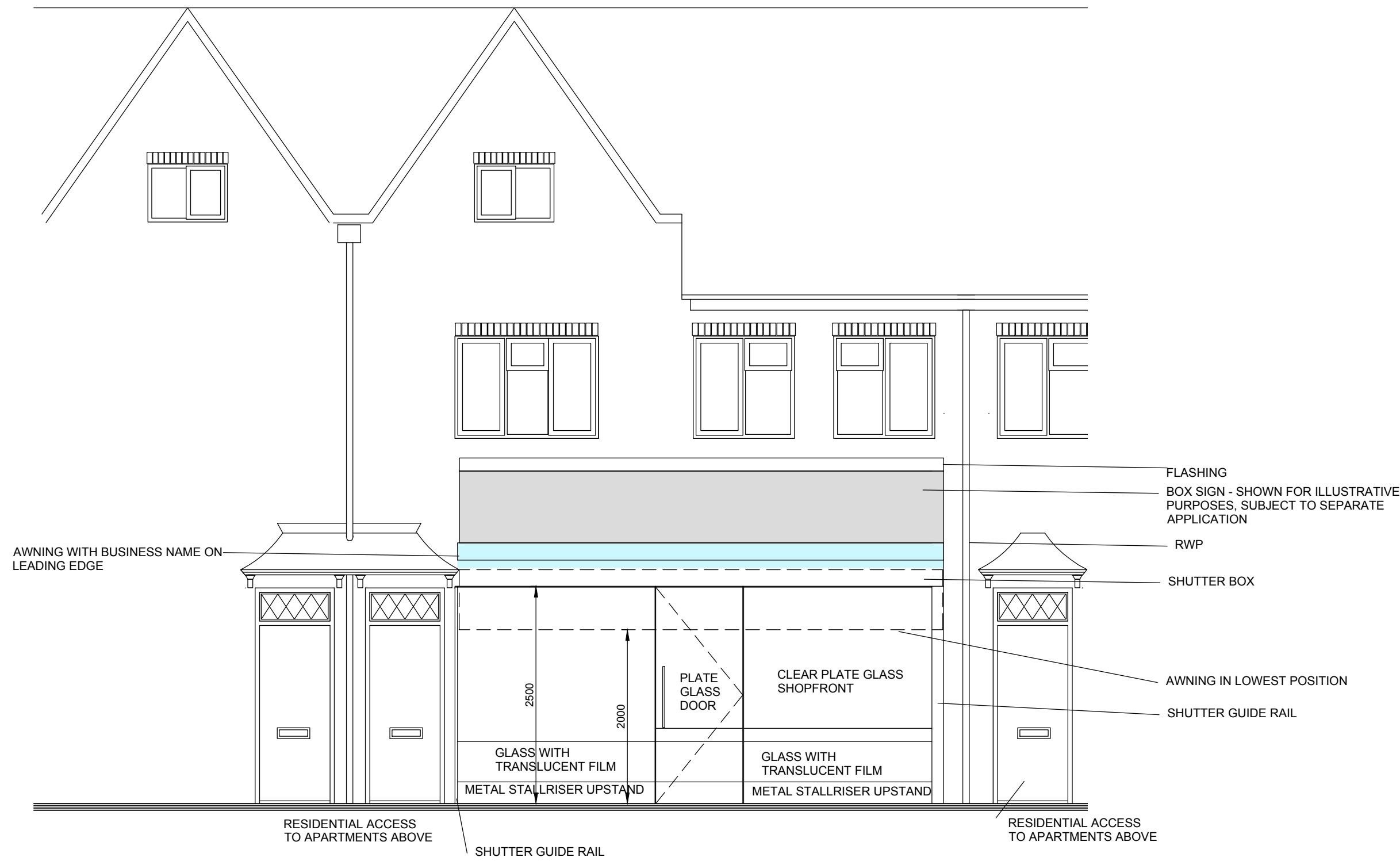
ELEVATION Scale: 1:50 @ A2