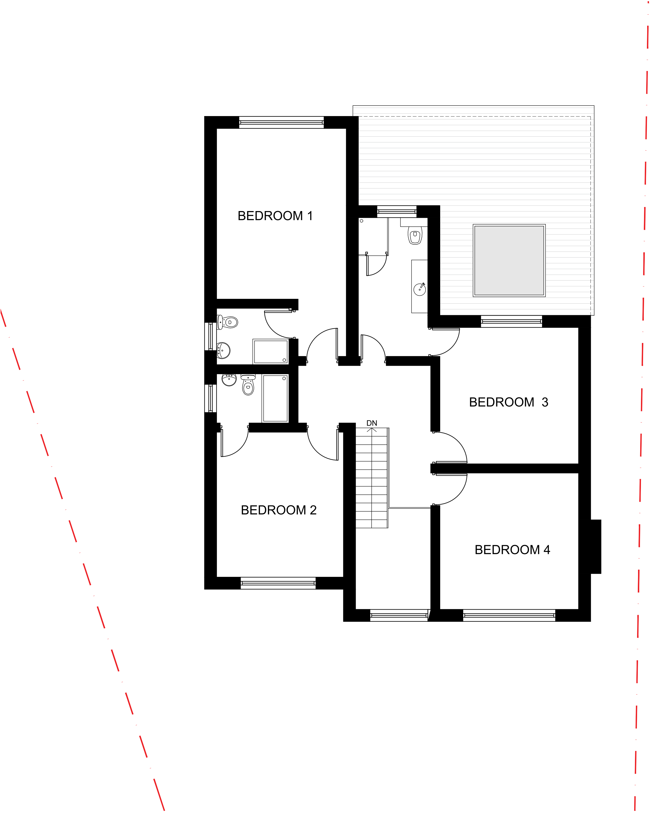
PRE-EXISTING FIRST FLOOR