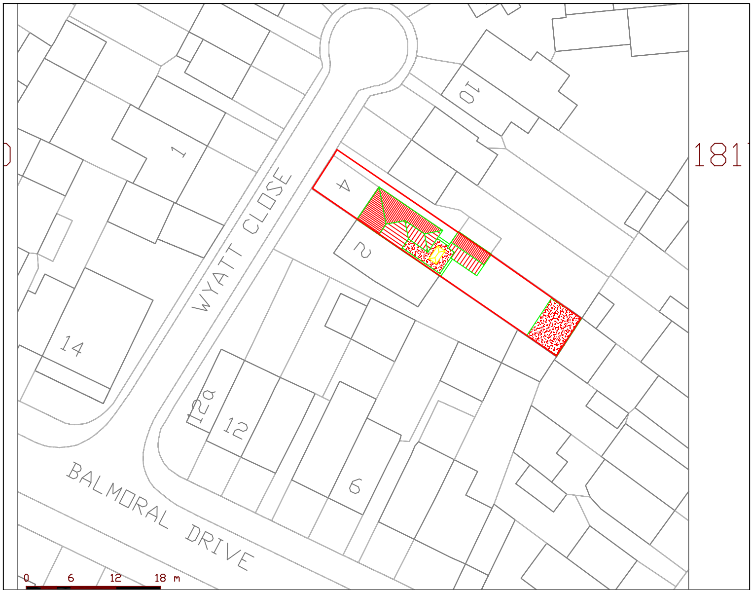
site location plan 1:500