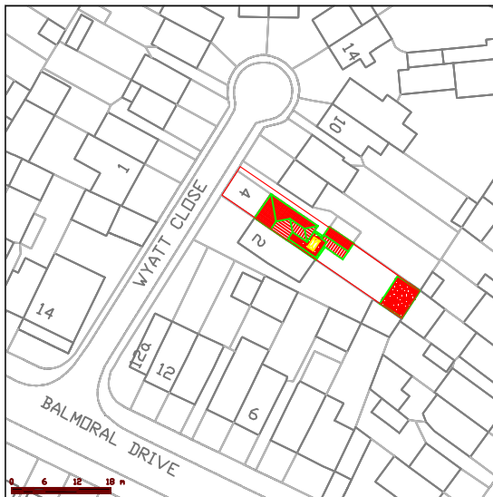
block plan 1:1250