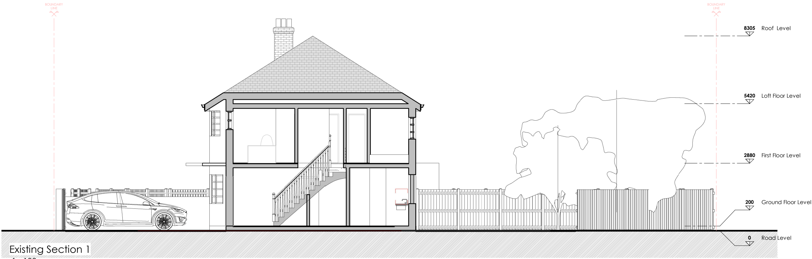
Existing Section 1 1 : 100