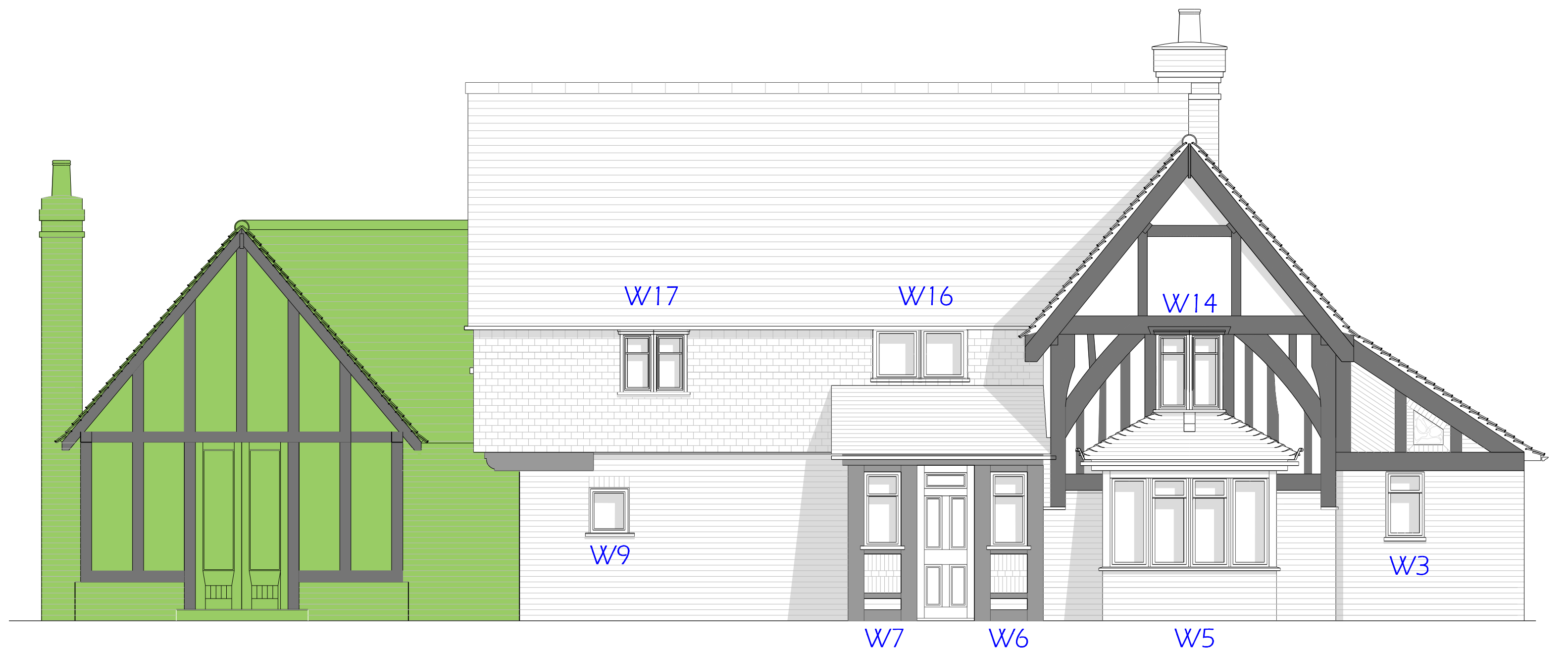
North East (Front) Elevation