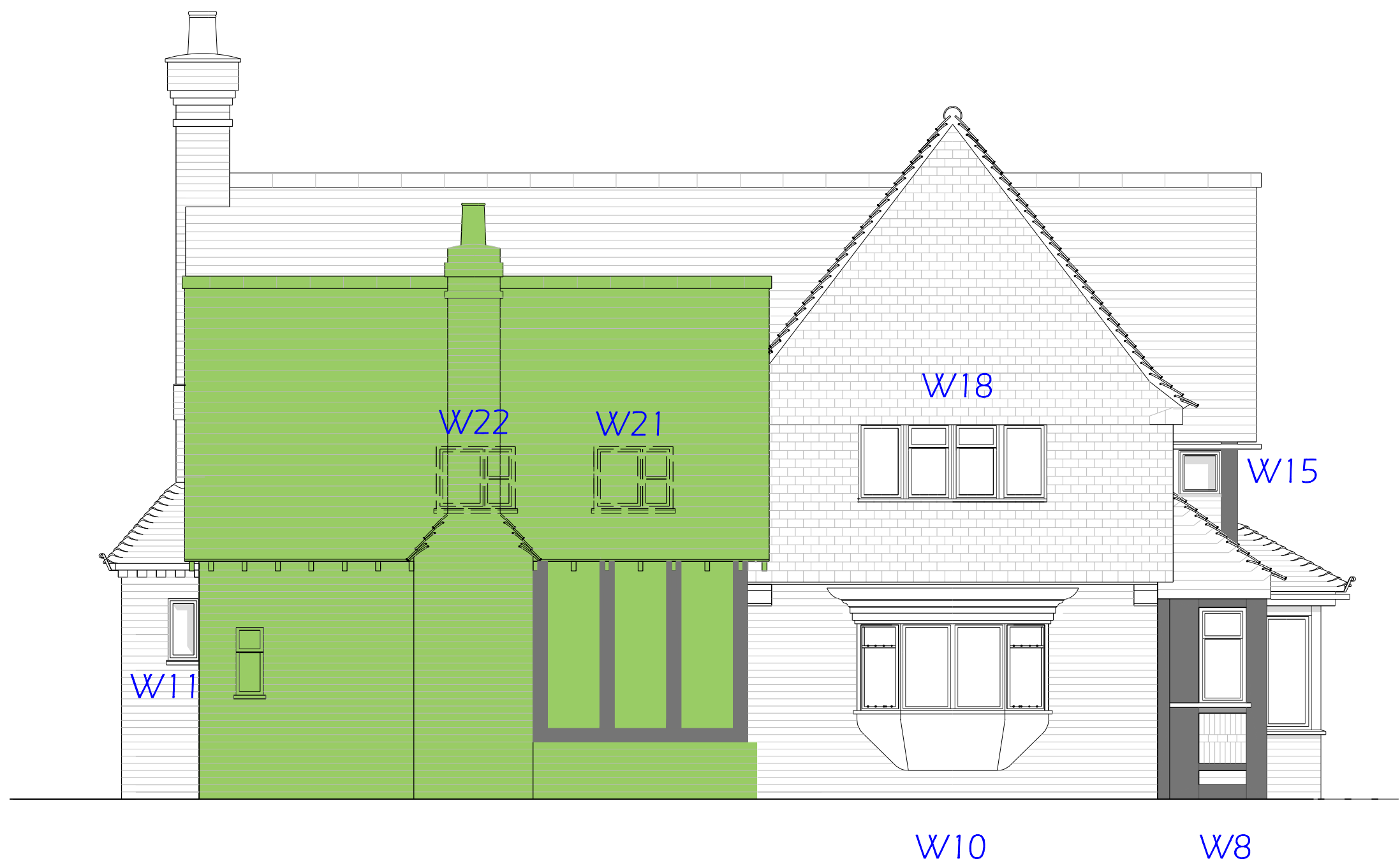
South East (Side) Elevation