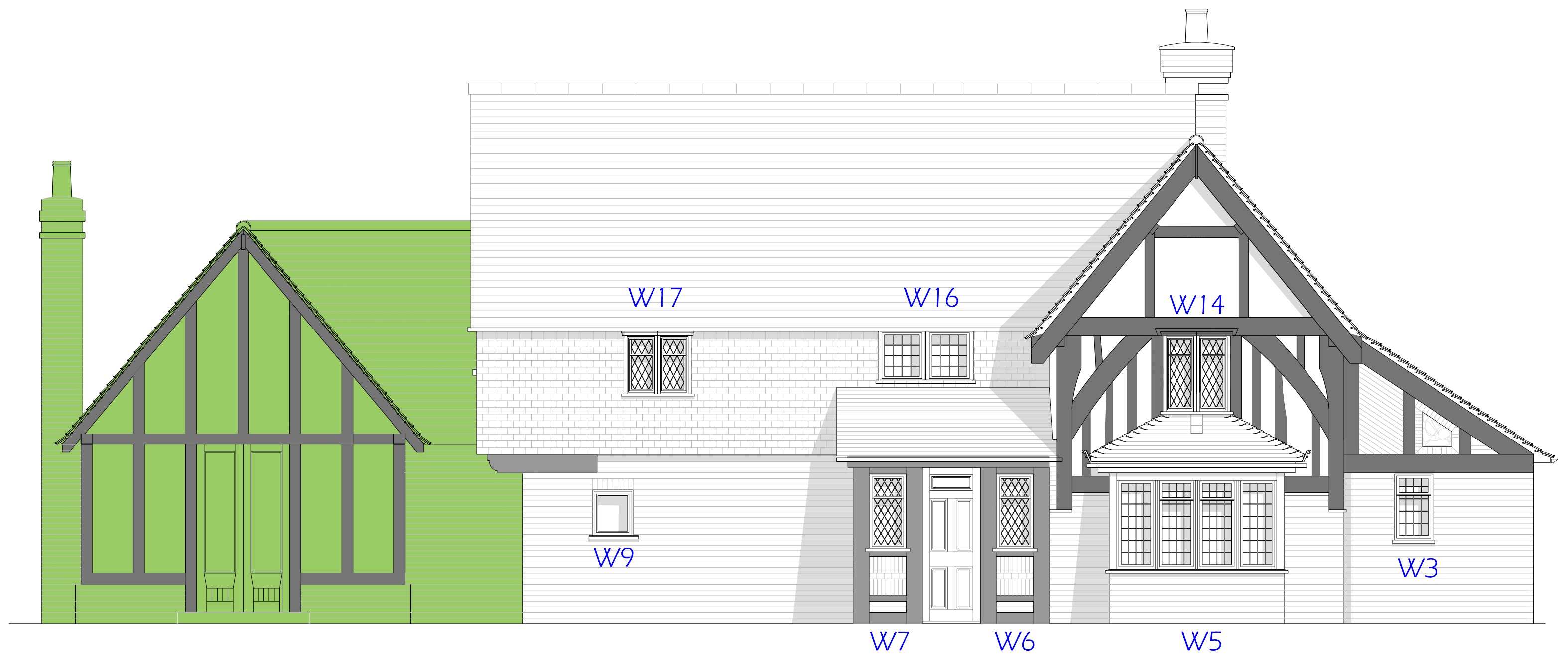
North East (Front) Elevation