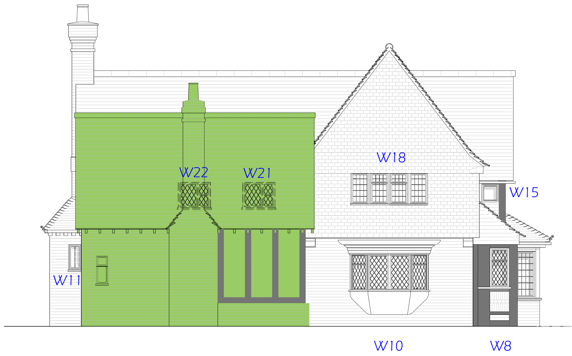
South East (Side) Elevation