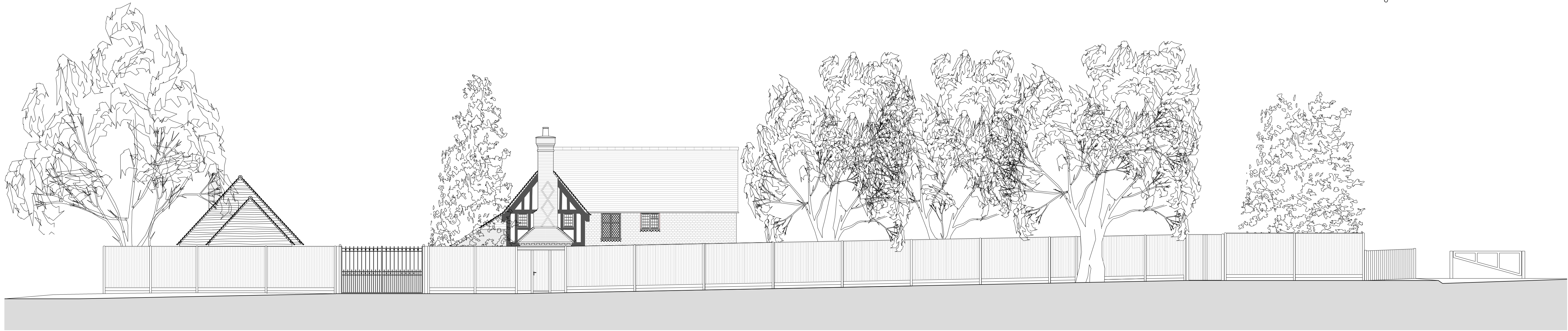
Cannons Bridge Farm