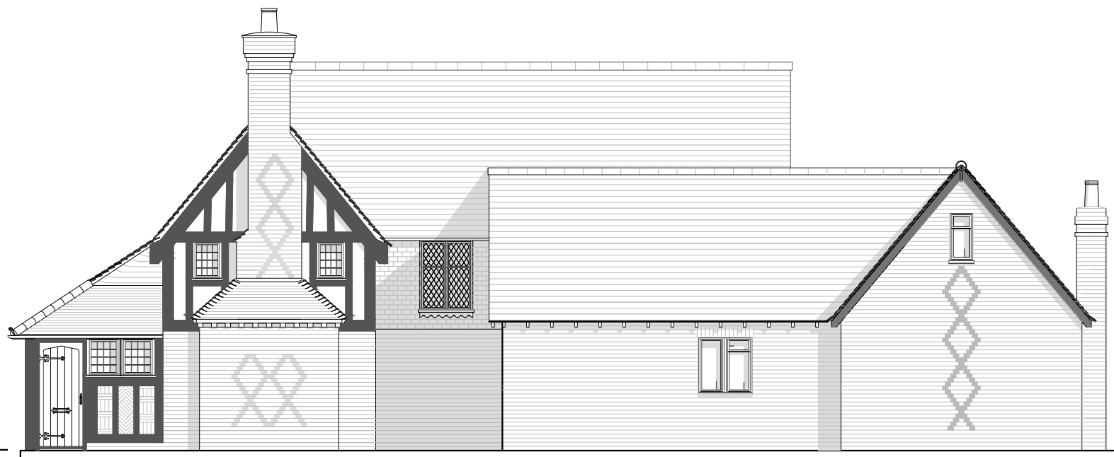
PROPOSED REAR (SOUTH-WEST) ELEVATION