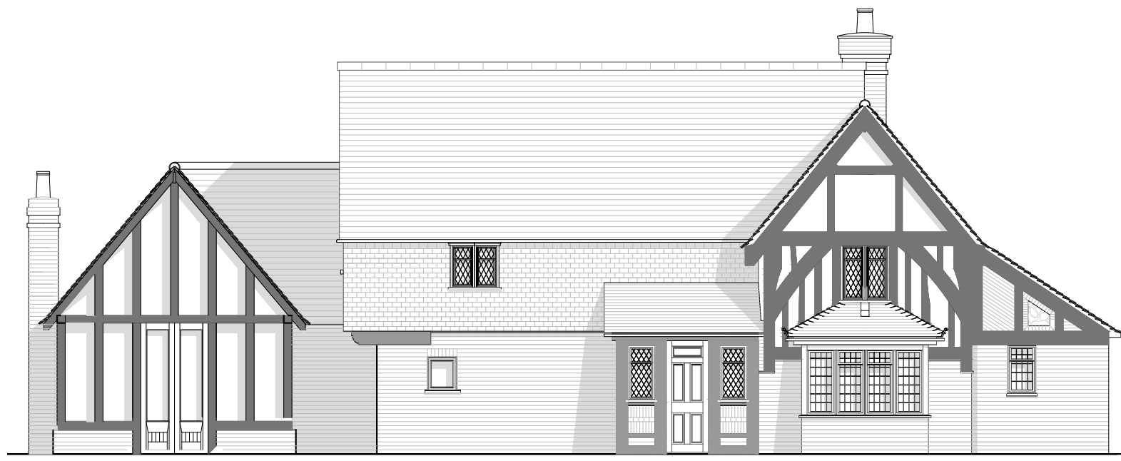
PROPOSED FRONT (NORTH-EAST) ELEVATION