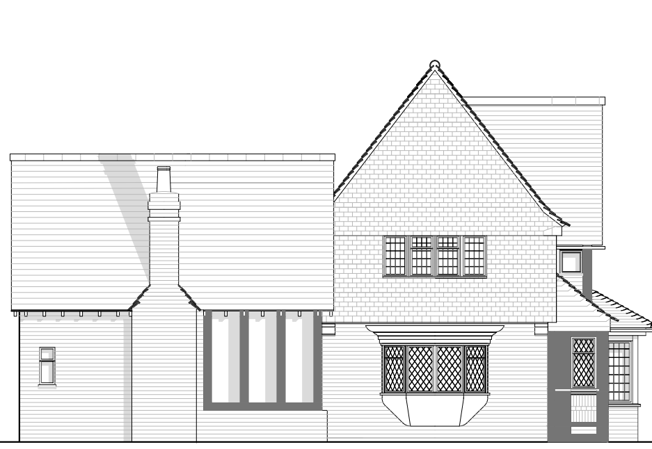
PROPOSED SIDE (SOUTH-EAST) ELEVATION