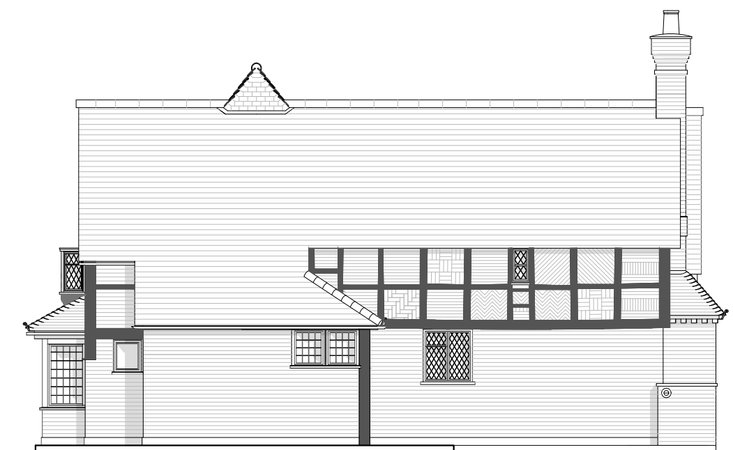
PROPOSED SIDE (NORTH-WEST) ELEVATION