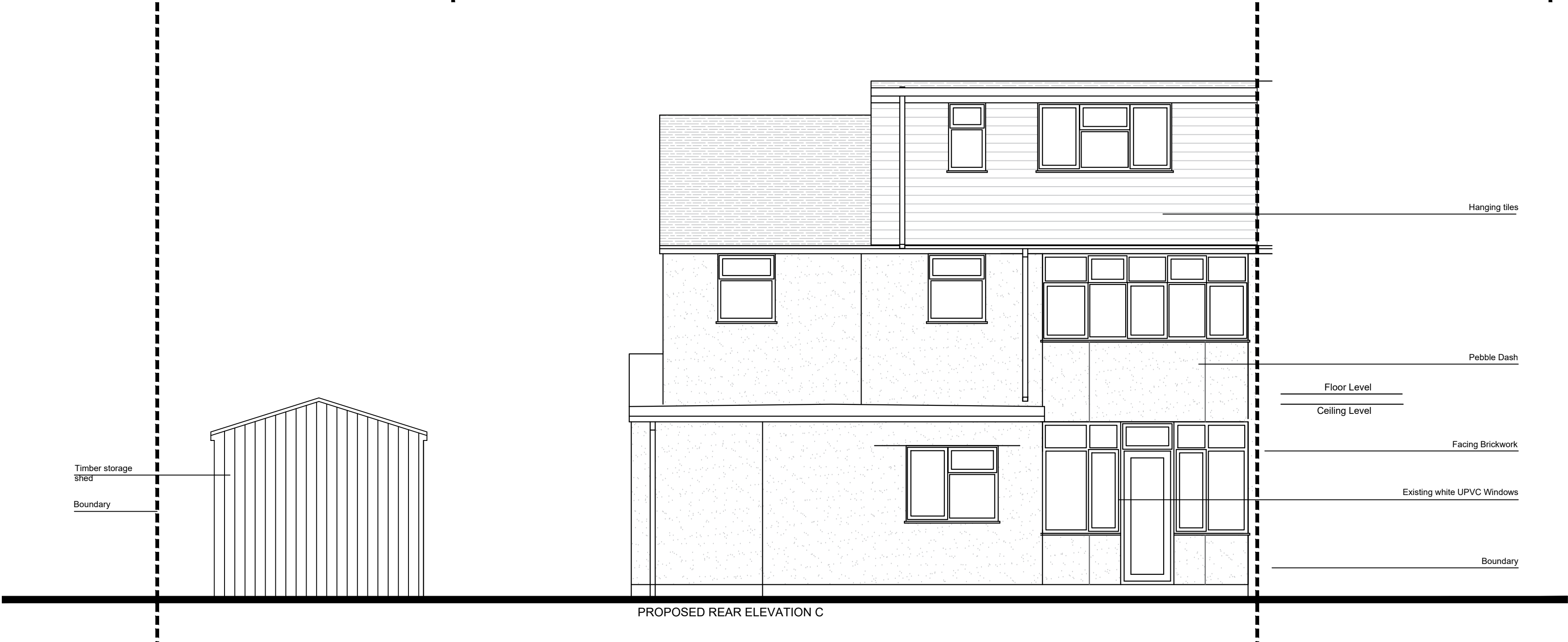
PROPOSED REAR ELEVATION C