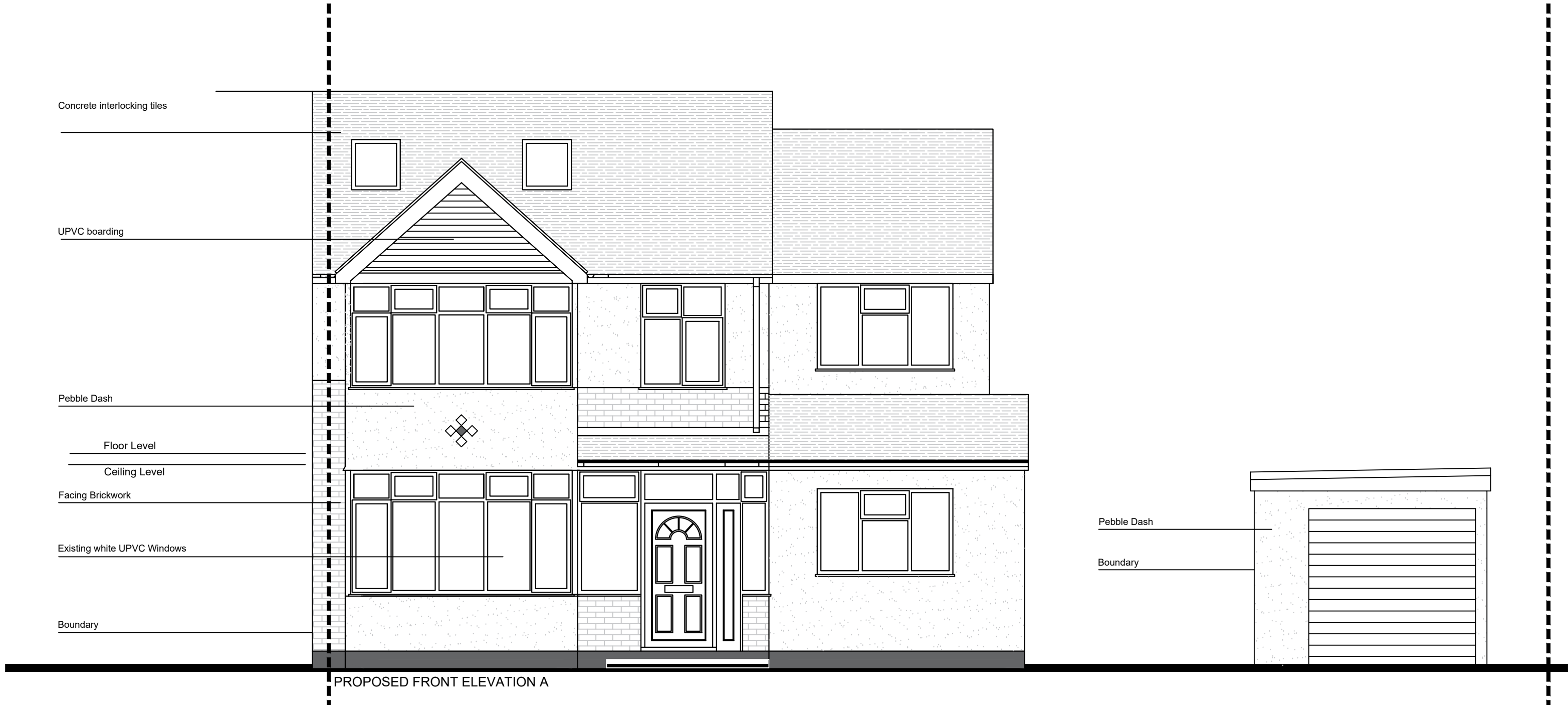
PROPOSED FRONT ELEVATION A