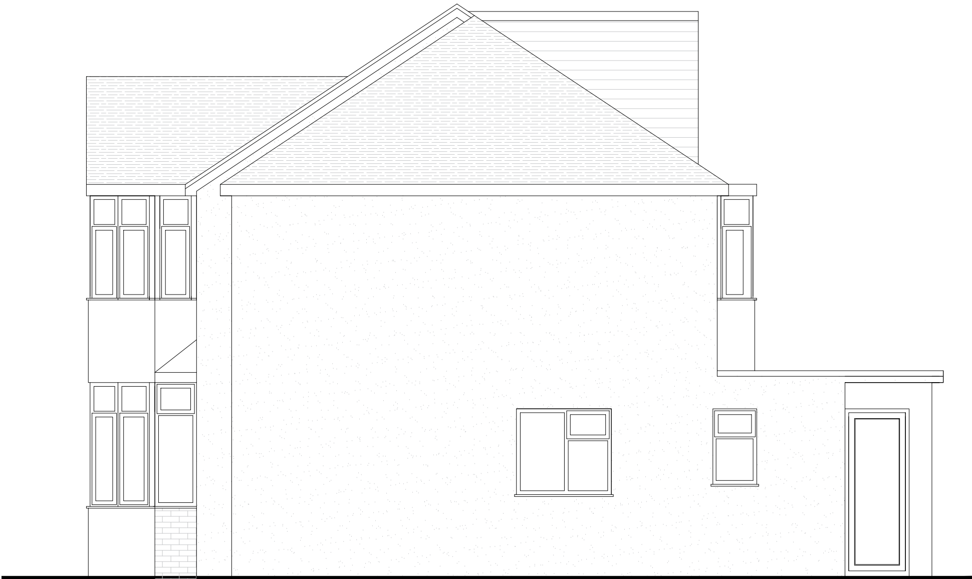
PROPOSED SIDE ELEVATION D