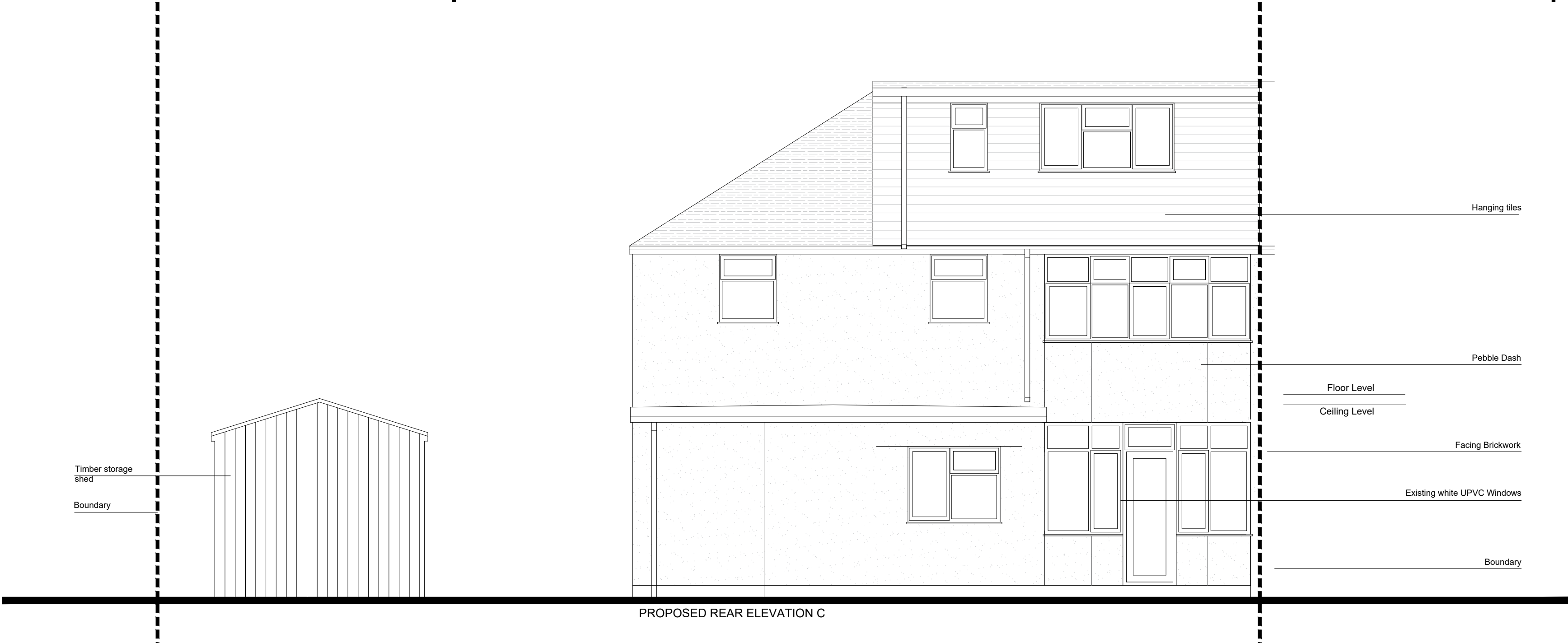
PROPOSED REAR ELEVATION C