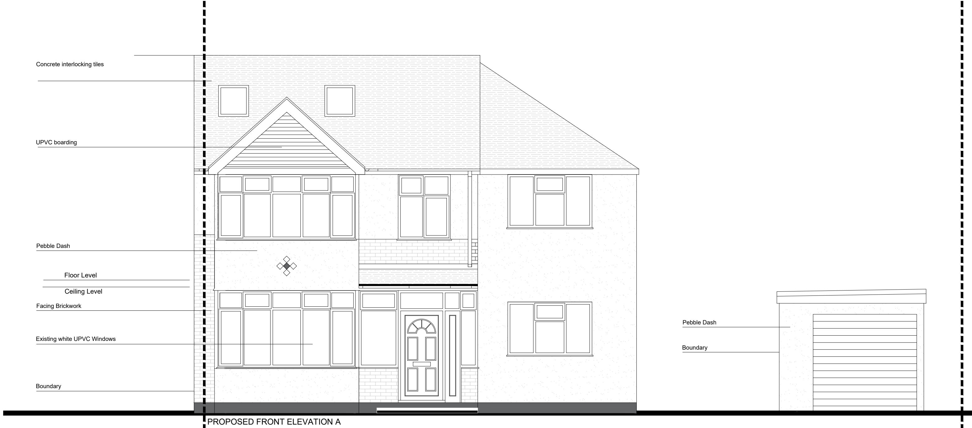
PROPOSED FRONT ELEVATION A