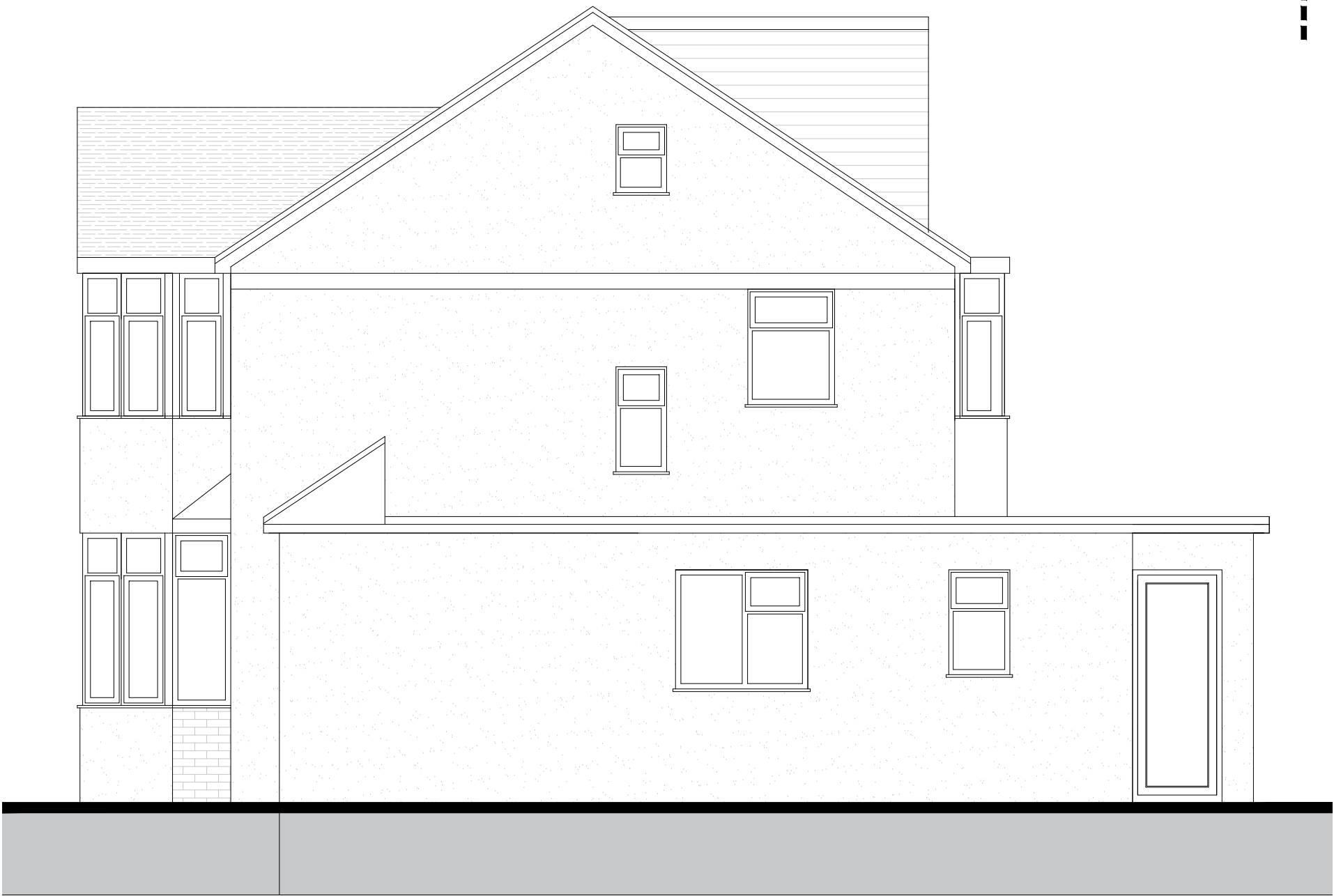
EXISTING SIDE ELEVATION D

Neha Abayawardana RIBA abay.architecture@yahoo.com