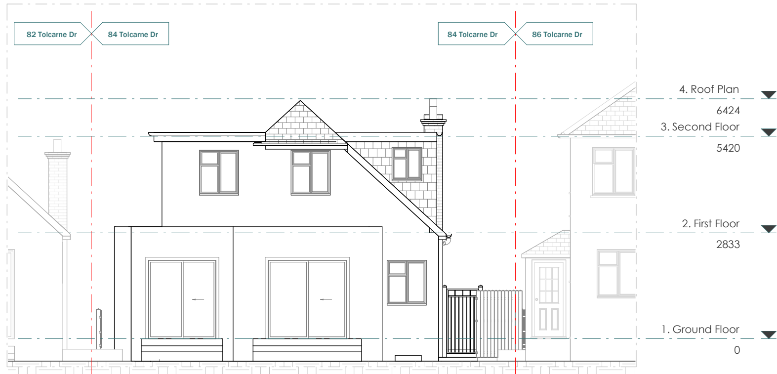
EXISTING REAR ELEVATION (Unchanged)