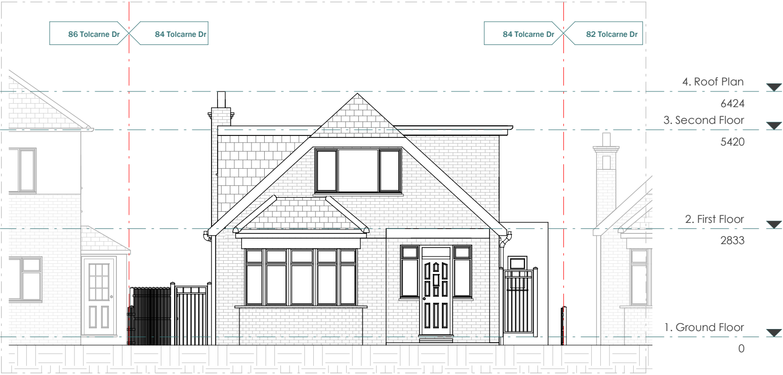
EXISTING FRONT ELEVATION (Unchanged)