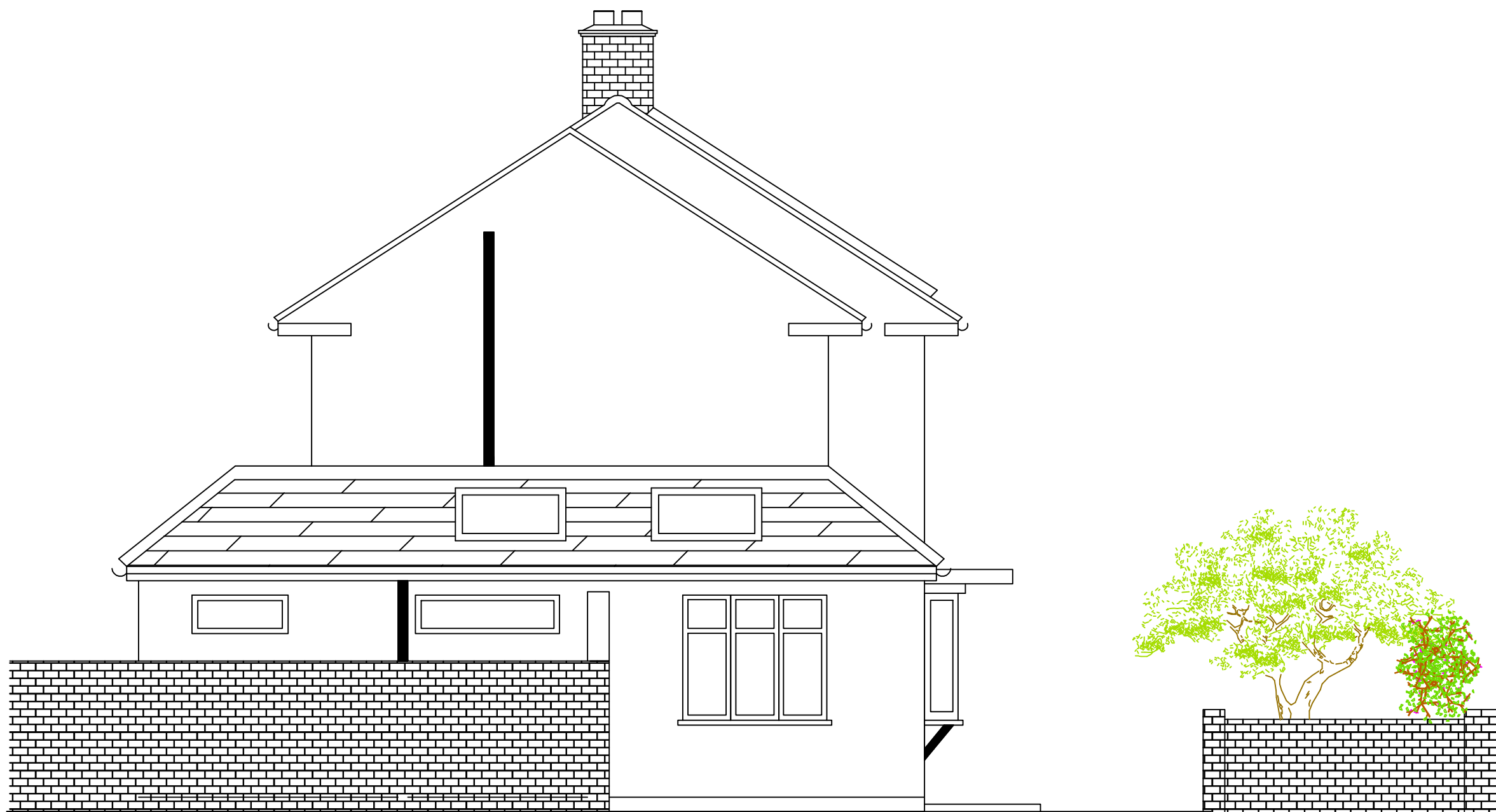
PROPOSED SIDE STREET SCENE

Planting Specification All native species should be of local stock. Native trees and shrubs certified as British Native plant stock. All planting stock should comply with the Horticultural Trade Association National Plant specification. All planting preparation, handling, planting and maintenance should be in accordance with CPSE Code for Handling and Establishing plants. All trees and shrubs to comply with BS3936 Part 1 1992, planted to BS 4043:1989 and BS4428:1989. Topsoil incorporated into planting beds to be gently rounded towards the centre of each bed to allow for settlement. On completion of planting the whole area of the shrub bed shall be mulched with 75mm consolidated thickness of medium textured decorative grade natural pine bark having first been prepared in accordance with the specification. Free standing hedges shall have a 3 strand galvanised wire and tanalised softwood timber post fence to BS 1722 Part 3: 1973 erected along a line between the two rows of hedge plants.