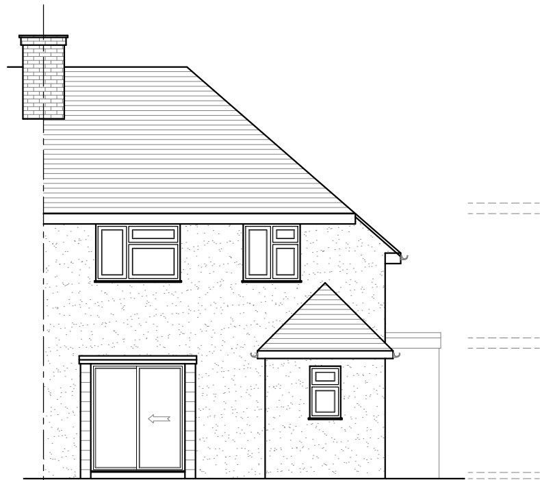
EXISTING REAR ELEVATION SCALE= 1:100