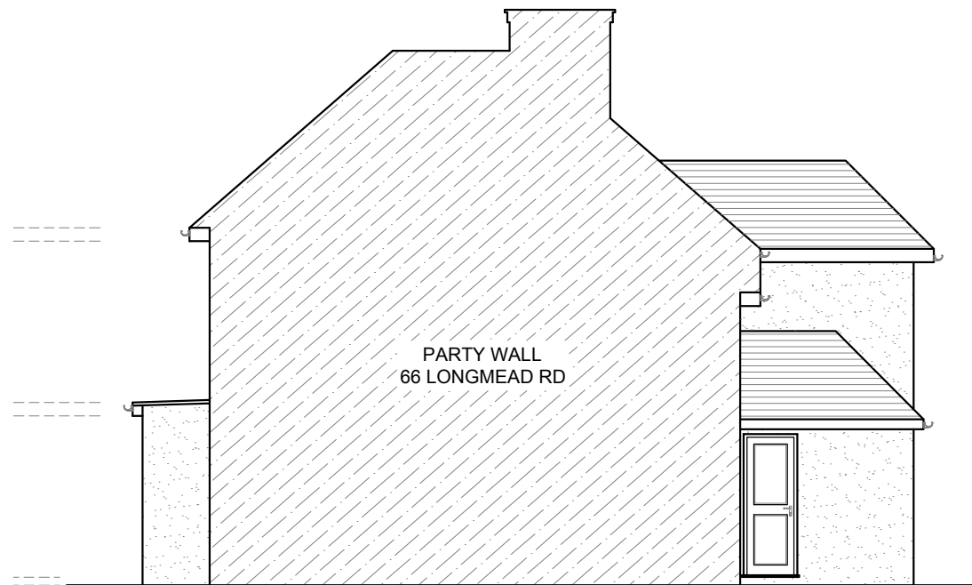
PROPOSED SIDE (P#66) ELEVATION SCALE= 1:100