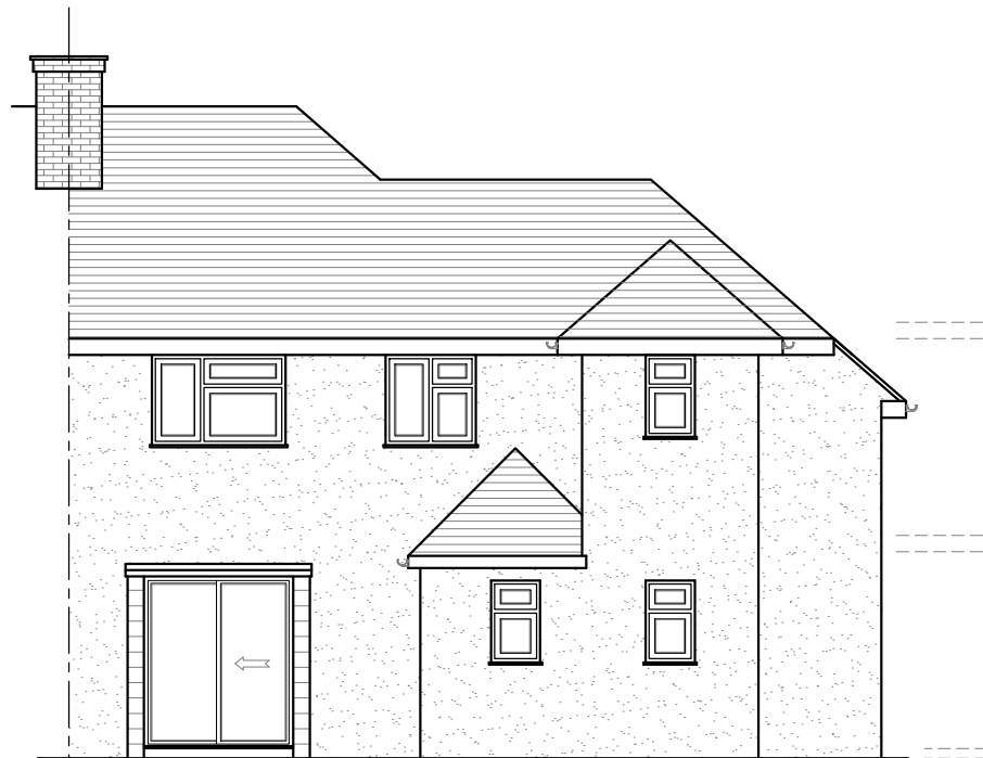
PROPOSED REAR ELEVATION SCALE= 1:100