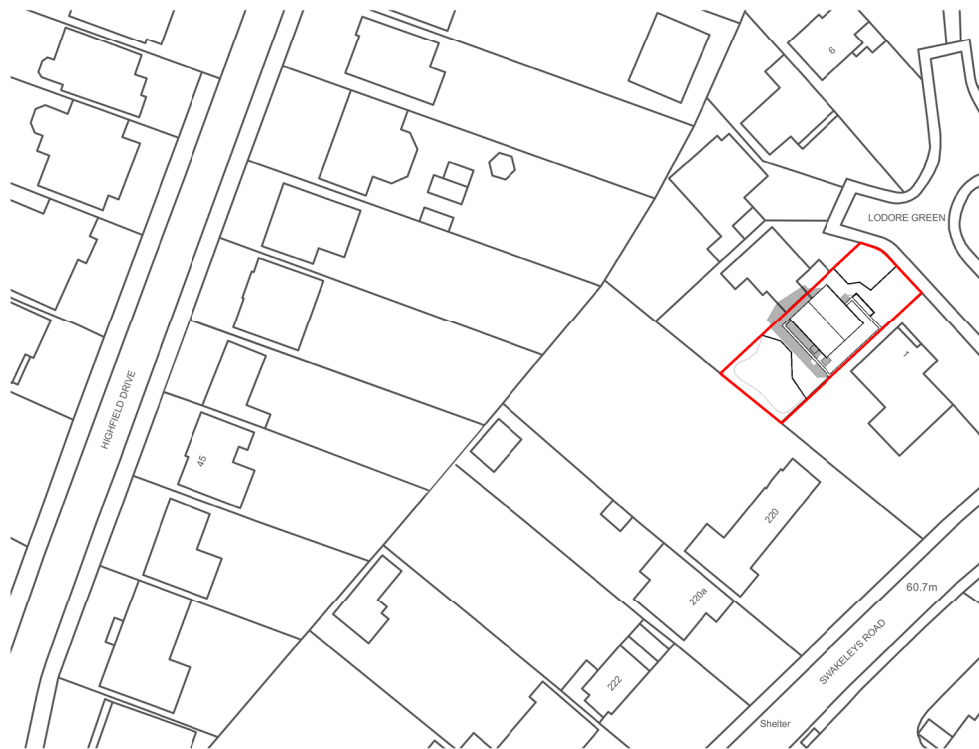
LOCATION PLAN 1 : 1250 @A3