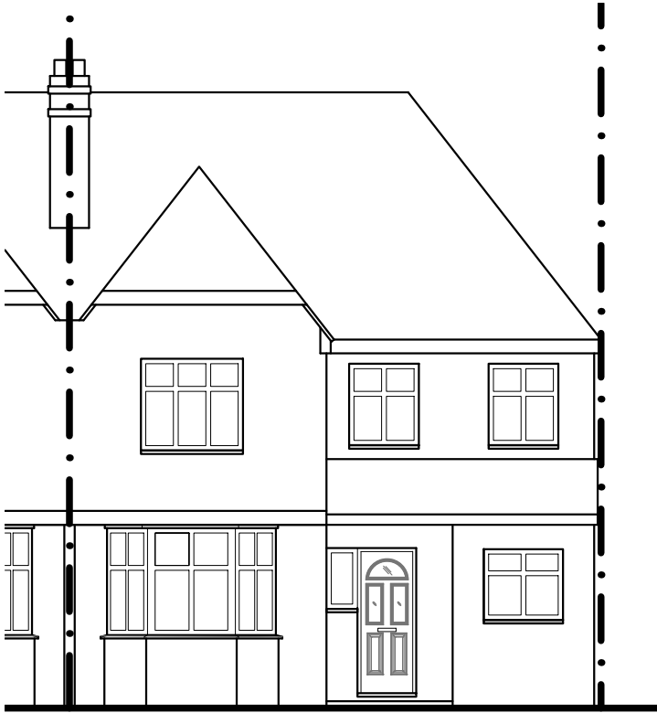
EXISTING FRONT (SOUTH-EAST) ELEVATION