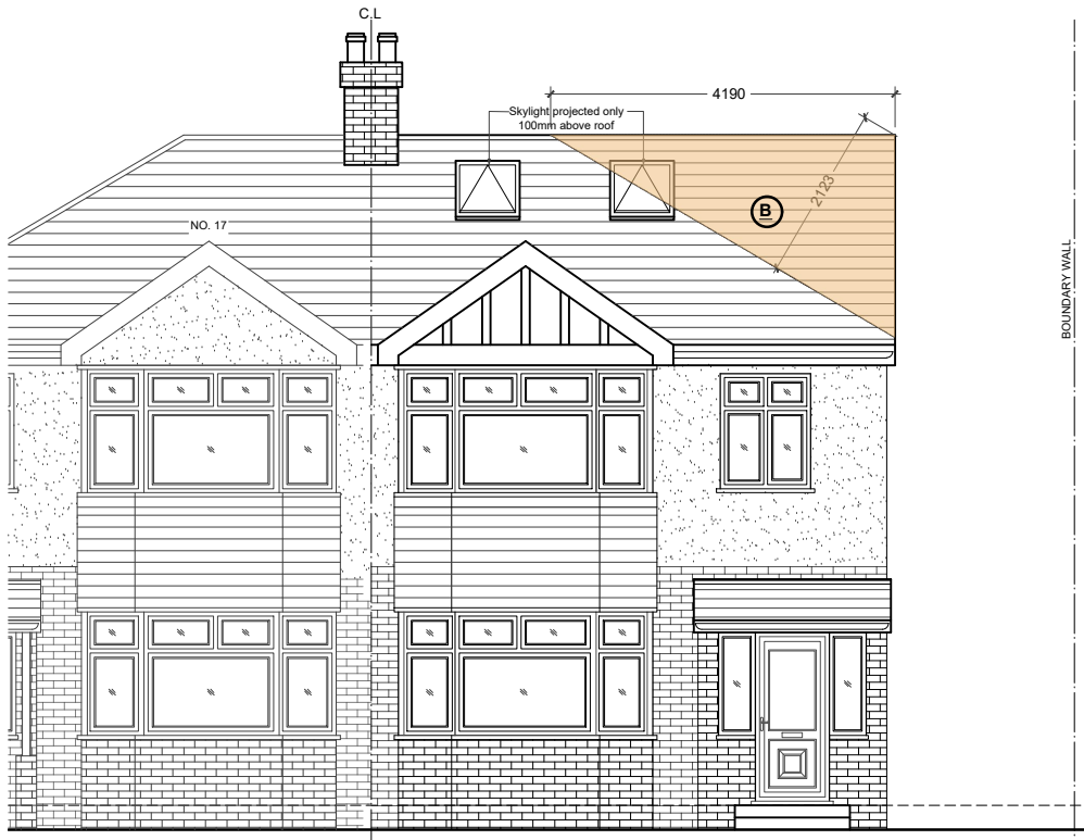
01 - FRONT ELEVATION