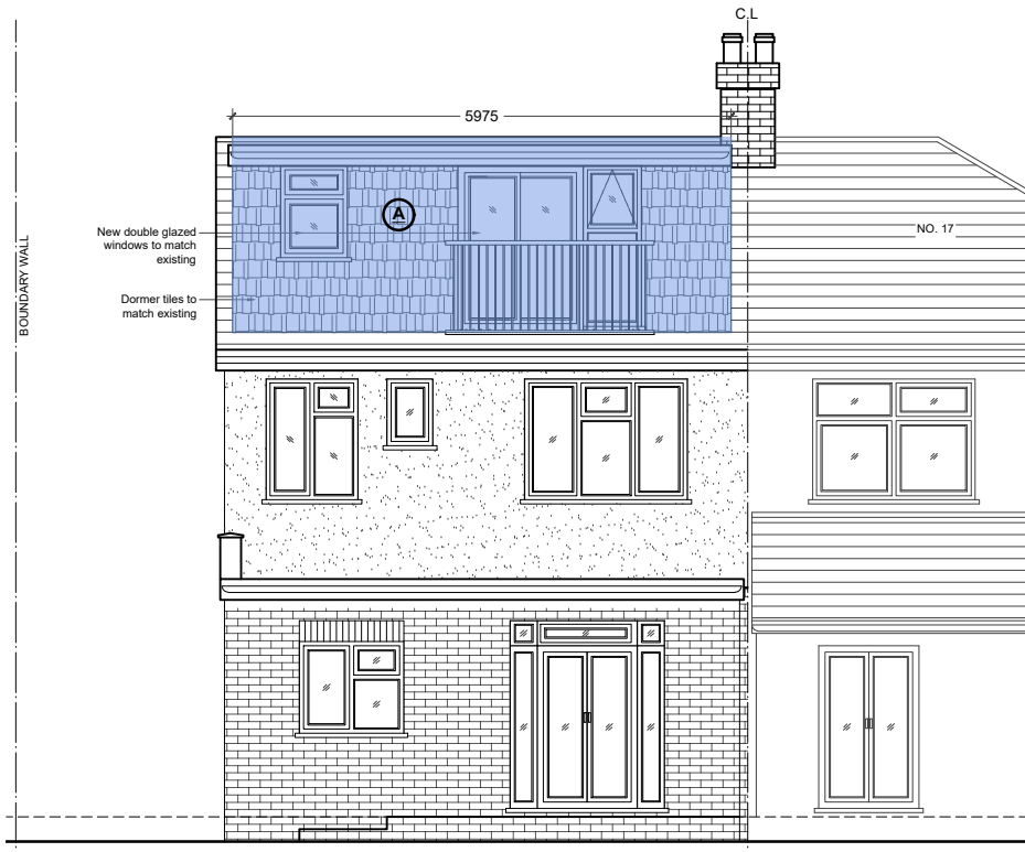
02 - REAR ELEVATION