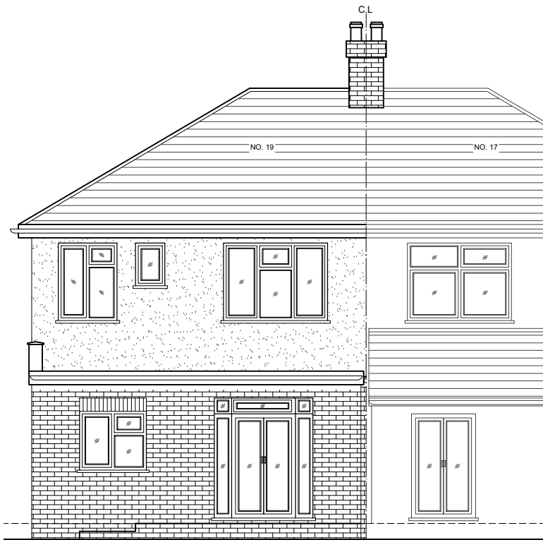
03 - REAR ELEVATION