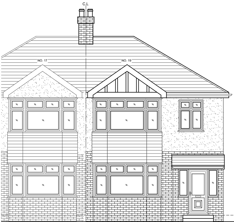
04 - FRONT ELEVATION